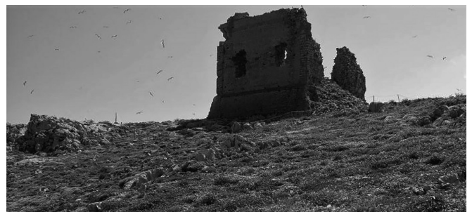
Fig. 4. Vegetal restoration after rat and wild rabbit eradication programs; left) April 2006, i.e. before the eradication; right) April 2010, i.e. after rat eradication project.