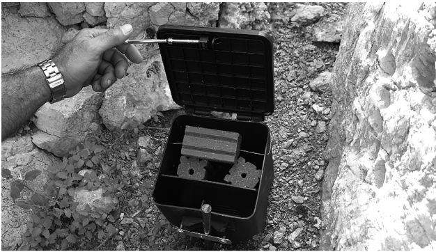
Fig. 2. A dispenser baited with three blocks of Brodifacoum (Solo Blox, ©Colkim Service).

to the 4 th century B.C. (La Rocca 2004). The island is a resting place for many migratory bird species, especially waders, warblers, herons and cormorants. Despite this, before rat eradication, Sardinian warbler and blackbirds were not present as breeding species. Since the 1980s, a colony of Mediterranean yellow-legged gull Larus michahellis (about 500 pairs) breeds on the island. Among other species, the Italian wall lizard Podarcis siculus and the black whip snake Hierophis carbonarius are present. Before the eradication project, Norway rats and introduced wild rabbits Oryctolagus cuniculus were present since after the Second World War. Rats were observed while feeding on plant seeds and gull pellets.