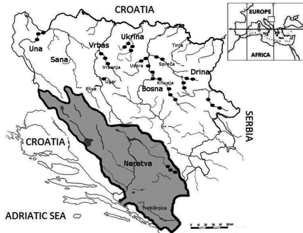
Fig. 7. Distribution of Barbatula barbatula in Bosnia and Herzegovina based on literature data. Danube (or Black Sea) catchment (unshaded), Adriatic Sea catchment (shaded).

As no major threats are recognised, it is included as LC species in the IUCN Red List (Freyhof 2011b) and the Red List of fauna of the Federation of Bosnia and Herzegovina (Škrijelj et al. 2013), respectively.