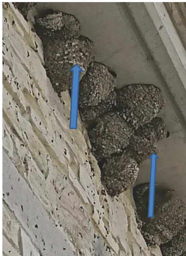
Fig. 2. A colony of house martins in which house sparrows have succeeded in appropriating nests at the 'cup' stage and successfully laid their own eggs in them (arrows). Completed and occupied house martin nests are evident around these usurped nests.

Upon continued attempts by the house sparrows to take over the partially built nest (Fig. 1), we observed a shift in the behaviour of the house martins. Observations were recorded on a cellular phone as photos and short video-clips.