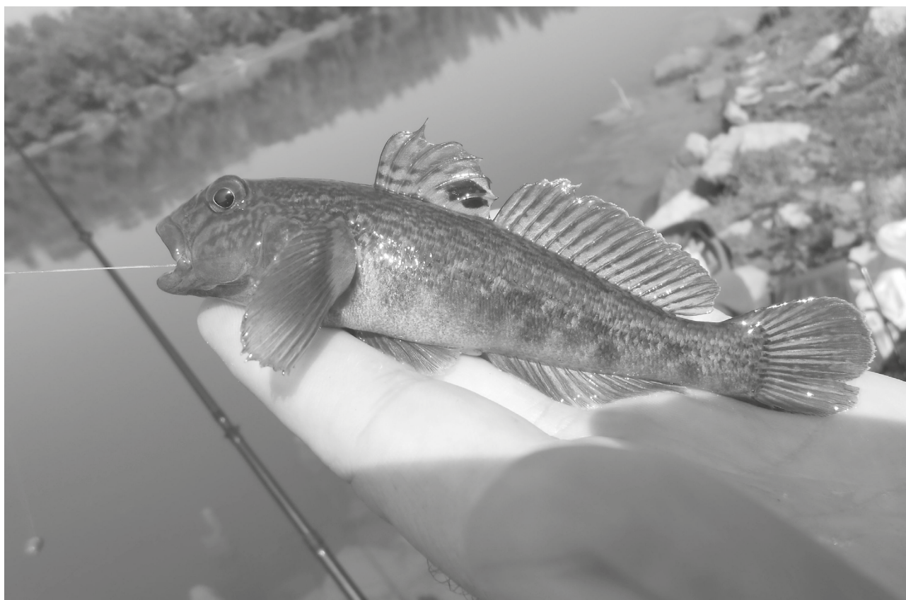
Fig. 3. Round goby Neogobius melanostomus from the Una River in Bosnia and Herzegovina (from Čolić et al. 2018; with the permission of Mr. Goran Šukalo).

Genus: Orsinigobius Gandolfi et al., 1986