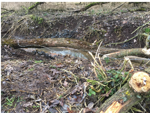
Fig. 2. Location of beaver occurrence in the Stobrawa Landscape Park (southwestern Poland).

The first day of each trip was devoted to setting the traps, which were then checked during the following days. Traps were placed at the study areas for two days on each trip. Our research was not conducted on a continuous basis, but in the form of ten separate trips. A hair sample was defined as all the hair collected from a single barb, including both guard hairs and undercoat fur. Samples were placed in test tubes with ethyl alcohol, and stored at -20 °C.