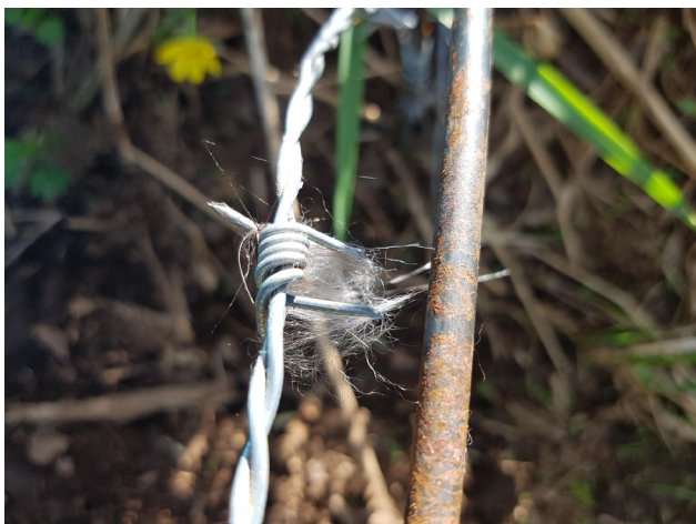
Fig. 3. A beaver hair sample containing undercoat and guard hair.