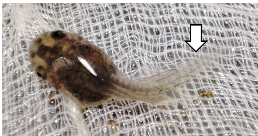
Fig. 2. Tadpole with regenerated tail tip (arrow) placed on wet fabric.

Small pieces (about 2 mm length) of the regenerated tail were homogenized in 100 \mu l of 70% glacial acetic acid. The remaining tissue can be stored in Carnoy's solution at 4 °C for a long period (months/years) or at room temperature for a shorter duration (days/weeks), but it is important