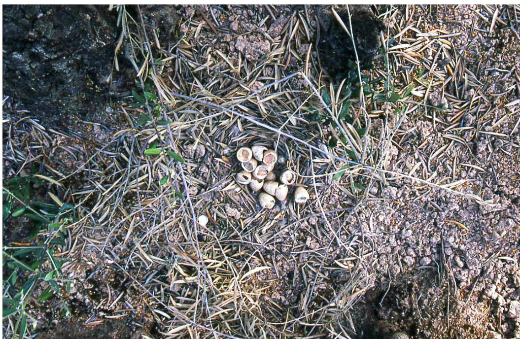
Fig. 2. Red-legged partridge nests with eggshells cleanly separated into two halves because of the hatching process.

The study period included three breeding seasons between April 1997 and August 1999. We detected partridge nests by intensively searching the study area. Olive groves are generally subject to intensive agricultural management, especially during spring and summer. During this period, every olive tree and the lanes between tree rows and the grove edges are weeded manually or with tools, and herbicides are applied. This level of management required the deployment of many workers who inevitably discovered most of the existing partridge nests in the grove. When a nest was discovered, the workers left it undisturbed by not cutting the surrounding vegetation. All the nest locations were reported to the estate gamekeeper, who also regularly monitored the nest and informed us of any hatching, nest loss, or clutch desertion. To avoid further disturbance to the nesting birds, nest monitoring was carried out only by this person, who kept a safe distance from them and used a 60× telescope (ATS Swarovski optic). We only visited the nests once the eggs had hatched or