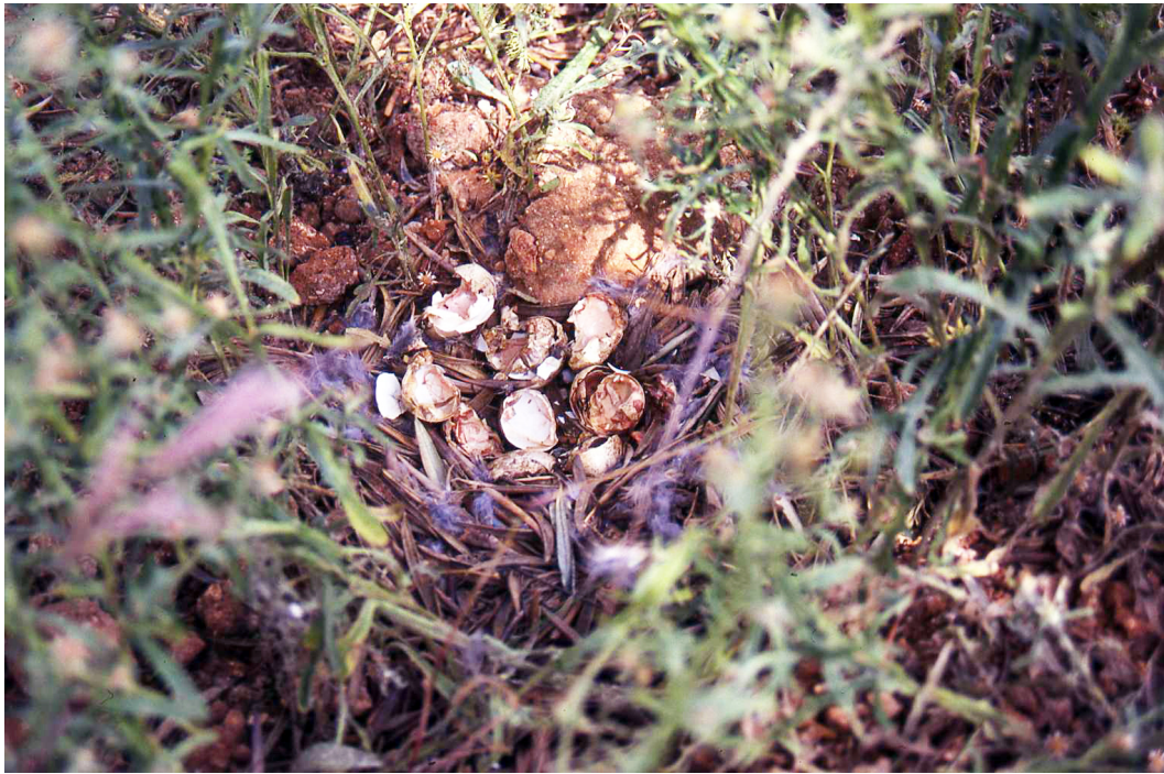
Fig. 3. Red-legged partridge nests in which broken eggs were found, which suggests predation.

failed. Nests with hatched eggs were easily identified since the eggshells were cleanly separated into two halves because of the hatching process (Fig. 2), while eggs disappeared, were broken (possible predation; Fig. 3), were unhatched, and were found cold much later than their expected hatching time in the failed nests.