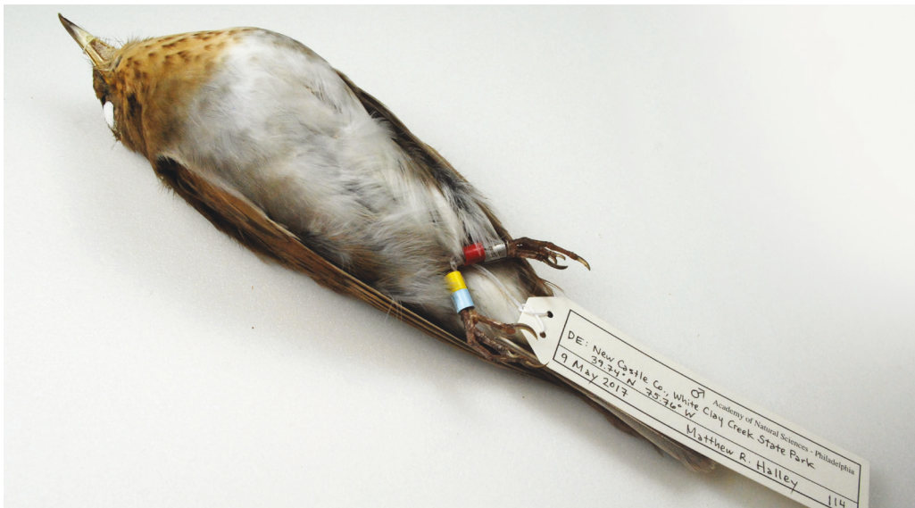
Figure 7. ANSP 204310, the neotype of Turdus mustelinus Wilson (= Catharus f. fuscescens ), see text for detail of the specimen's provenance (Matthew R. Halley)

Art. 72.7 of the Code (ICZN 1999). It is not, however, unambiguously identifiable because none of its type material is extant or traceable, and the attributes described in the original description of T. mustelinus Wilson are shared by more than one species. To fix the taxonomic identity of Turdus fuscescens Stephens, 1817, so that traditional nomenclature is maintained and to prevent destabilising confusion arising from alternative identifications, I hereby designate as its neotype ANSP 204310, a colour-banded male deposited in the collection of the Academy of Natural Sciences of Drexel University, Philadelphia. This action fulfills the requirements for neotype designation in the Code (ICZN 1999) by: clarifying the taxonomic application (status) of the name, as explained above (Art. 75.3.1), describing, illustrating and referencing the defining characters of Veery and its neotype (Art. 35.3.2), providing data sufficient to ensure recognition of the specimen designated (Art. 75.3.3), providing grounds for believing that all original type material has been lost and is untraceable (Art. 75.3.4), showing that traits of the neotype are included in the original description (Art. 75.3.5), choosing the neotype from a locality in the same physiographic province (second-growth Mid-Atlantic Piedmont forest) where Wilson collected some of his type material (Art. 75.3.6), and recording that the neotype is preserved as the property of a recognised scientific institution (Art. 75.3.7).