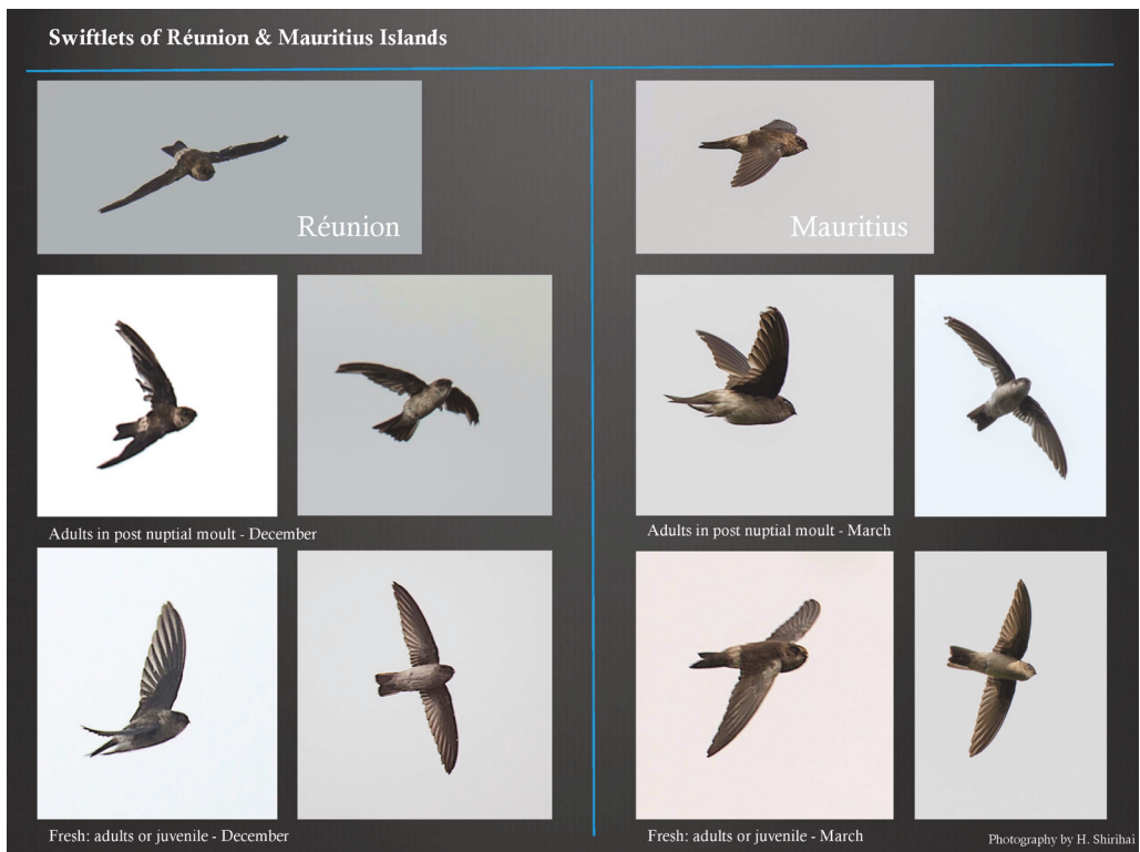
Figure 4. Comparative field photographs of the Reunion and Mauritius populations of Mascarene Swiftlet Aerodramus francicus in both fresh (lower line) and very worn plumages (middle line); the bird top left is at the extreme end of variation in the white rump patch of this island's population (Hadoram Shirihai)

patterned below than those of nominate francicus , displaying much more obvious shaft-streaks on the lower breast and belly, and a sharper division between the darker throat and breast vs. paler (and greyer) remainder of the underparts; in nominate francicus this pectoral band effect is much reduced, as well as being much higher on the breast. A. f. saffordi is separated from the similar but larger and darker Aerodramus elaphrus of the Seychelles by most of the same characters as can be used to distinguish the latter from nominate francicus , namely the shorter wings and bill of saffordi ( A. elaphrus has wing 115–119 mm and bill to feathers 7.5–8.0 mm; Rocamora 2013), its narrower wing base and smaller eye. In contrast to nominate francicus , the rump patch of saffordi being rather less obvious within the otherwise dark upperparts, is more similar to A. elaphrus .