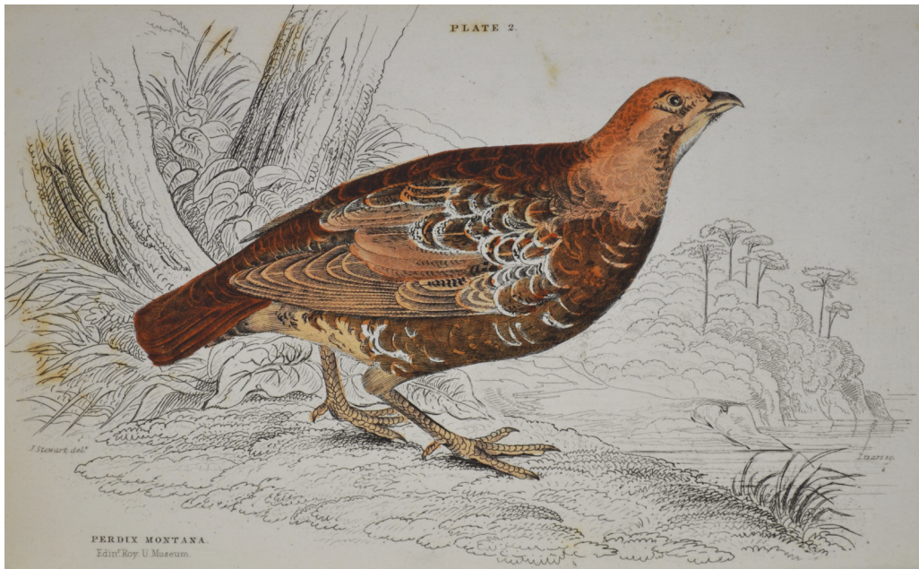
Figure 1. Mountain Partridge Perdix montana . Brisson knew this 'species' only from the mountains of Lotharingen, France, hence montana . However, subsequently ' montana ' was proven to occur all over Europe and to be a melanistic form of Grey Partridge P. perdix . From Sir William Jardine's Naturalist's library , 1834, The natural history of game birds