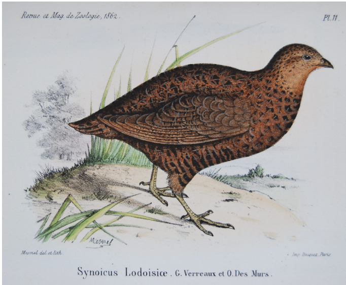
Figure 14. Synoicus lodoisiae , in Verreaux & des Murs (1862), which proved to be a melanistic variety of Common Quail Coturnix coturnix