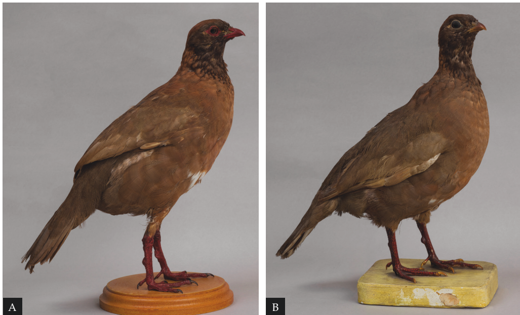
Figure 6. Mounted specimens at Muséum des sciences naturelles d'Angers, France. A: MHN.An.2003.522. B: MHN.An.2003.523

'Perdrix lugubres, achetée 10 francs' It is unclear whether 1863 is the date of acquisition, collection or registration. 1863, however, appears to be incorrect for collection or acquisition as, based on de Soland (1861), these specimens must have been present in the museum