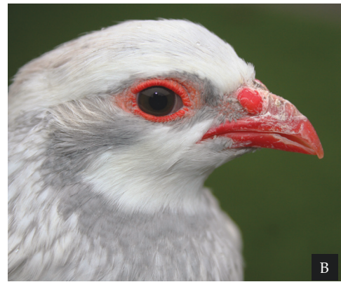
Figure 18. 'Diluted' Red-legged Partridge Alectoris rufa , bred and held in captivity (© Nico van Wijk)