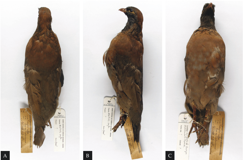
Figure 9. Specimen (relaxed mount, MNCN-A4955) at Museo Nacional de Ciencias Naturales, Madrid, Spain, labelled 'Sur-oeste de Europa, probablemente España'