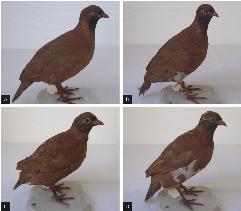
Figure 7. Mounted specimens at Museum de Société des Sciences Lettres et Arts de Cholet et sa région, France. A: SLA274-37.2. B: SLA288-37.6. C: SLA266-37.7. D: SLA265-37.8