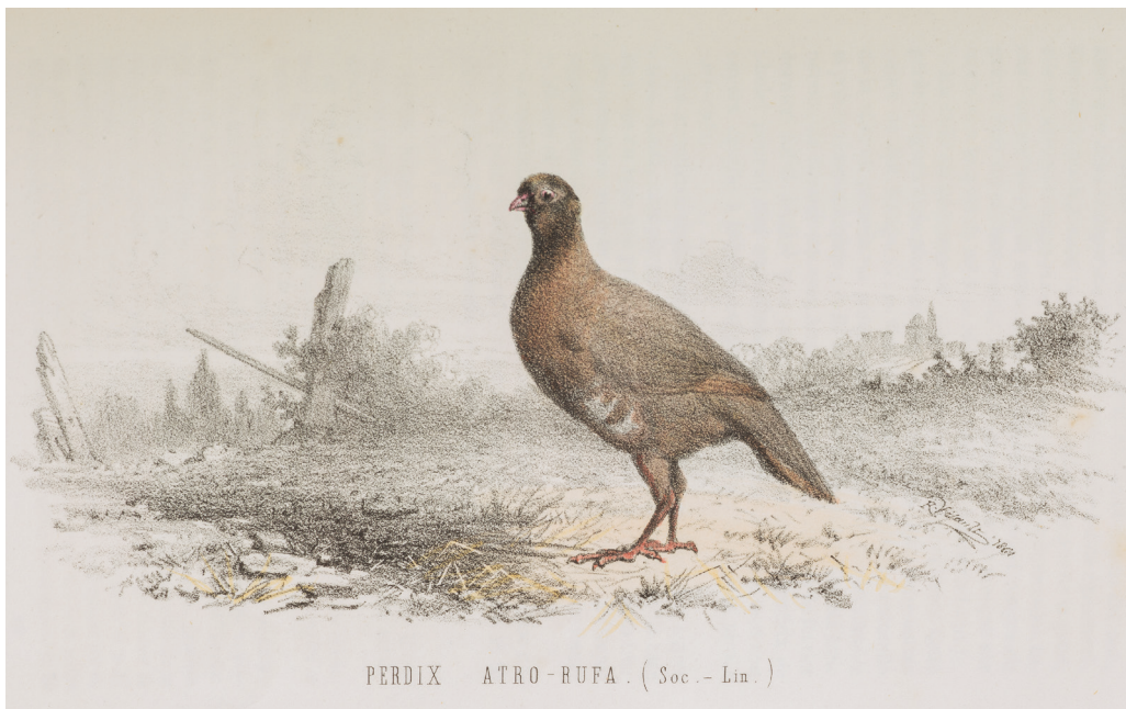
Figure 2. Perdix atro-rufa , the melanistic variety of Red-legged Partridge, described taxonomically by de Soland (David Riou, © Musées d'Angers)