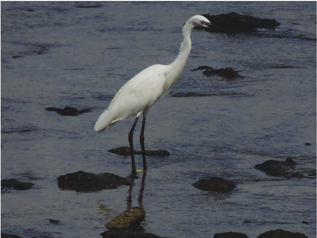
Figure 3. Little Egret Egretta garzetta , Ponta do Air France, Fernando de Noronha, Pernambuco, Brazil, March 2017 (Eduardo Augusto Ferreira)

Western Reef Heron E. gularis is polymorphic in plumage, which can be dark grey, usually with a white throat, white or intermediate, with a mixture of white and grey (Fedrizzi et al. 2007, Martínez-Villata et al. 2019b). The latter species has the eyes lemon yellow, maxilla blackish, mandible yellowish, and the bill overall heavier and more decurved than in Little Egret E. garzetta and Snowy Egret E. thula (Fedrizzi et al. 2007, Kirwan et al. 2019).