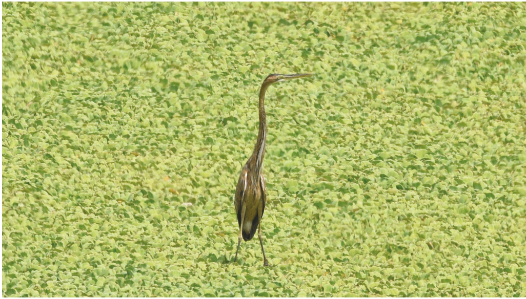
Figure 2. Purple Heron Ardea purpurea , Açude do Xaréu, Fernando de Noronha, Pernambuco, Brazil, March 2017

recorded in Brazil: Purple Heron Ardea purpurea , Grey Heron A. cinerea , Squacco Heron Ardeola ralloides , Western Reef Heron Egretta gularis and Little Egret E. garzetta (Silva-e-Silva & Olmos 2006, Fedrizzi et al. 2007, Silva-e-Silva 2008). All records of these species to date are from Fernando de Noronha or Rocas São Pedro e São Paulo, with Purple Heron, Western Reef Heron and Squacco Heron on the former. The many records of Ardeola ralloides suggest it is established on Fernando de Noronha (see Whittaker et al. in press). However, Ardea purpurea was observed only in June 1986, an 'immature', which record lacks documentation (Teixeira et al. 1987, Piacentini et al. 2015), and the only record of Egretta garzetta was at Rocas São Pedro e São Paulo (Bencke et al. 2005), a small and isolated group of rocky islets 1,100 km north-east of the coast of Rio Grande do Norte and 630 km north-east of Fernando de Noronha. Here we describe the first documented record of Ardea purpurea in Brazil, and the second for E. garzetta .