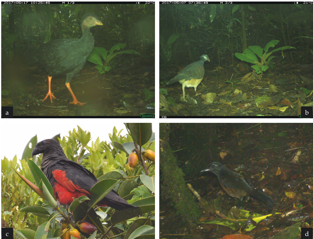
Figure 2(a) Red-legged Brushturkey Talegalla jobiensis ; (b) Thick-billed Ground Pigeon Trugon terrestris ; (c) New Guinea Vulturine Parrot Psittrichas fulgidus ; (d) Greater Melampitta Megalampitta gigantea , all camera-trapped in the Agogo Range.