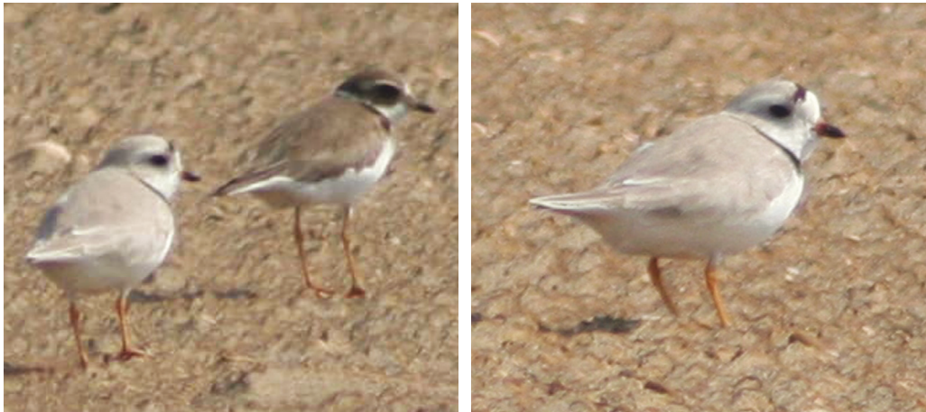
Figures 4–5. Non-breeding Piping Plover Charadrius melodus , Ciénaga de los Olivitos Wildlife Refuge and Fishing Reserve, Zulia, Venezuela, March 2020 (Lermith Torres)