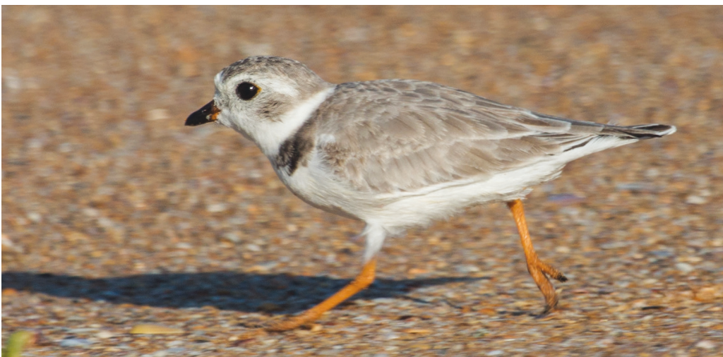
Figures 2–3. Non-breeding Piping Plover Charadrius melodus , Playa El Pico, western Paraguaná Peninsula, Falcón, Venezuela, February 2018

crown by a broad white supercilium, creating a plain face, within which the large black ‘button eye’ was prominent, producing an overall ‘innocent expression’. The sooty lateral breast-band was the darkest area of feathering, with no black in the rest of the plumage. This is the first record for Venezuela and the second for continental South America.