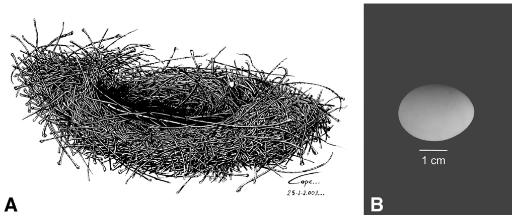
Figure 1. (A) Nest of Striped Woodhaunter Automolus subulatus virgatus , collected at Finca Rafiki, Santo Domingo, Perez Zeledón, San José Province, Costa Rica (nest 2). (B) Immaculate white egg found in the nest

accompanied the nest (MZUCR-H205; Table 1; Fig. 1B) but the specimen label provides no details regarding clutch size or egg development. The size of the hole opened in the egg, however, suggested that it may have contained a well-developed embryo when collected.