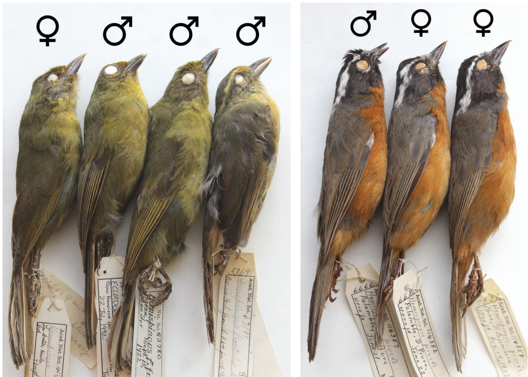
Figure 5 (left). Lateral view of Oleaginous Hemispingus Sphenopsis frontalis (Chapman, 1923). From left to right, (1) ANSP 141983, adult female S. f. frontalis prepared by Kjell von Sneidern on 20 March 1939 at 'La Costa, Huila, Colombia'. (2) ANSP 185826, adult male S. f. frontalis , prepared by Tristan J. Davis on 22 July 1992 at 'Panguri; ca. 12 km NE San Francisco del Vergel', Zamora Chinchipe, Ecuador. (3) ANSP 83780, adult male S. f. frontalis , collected on 15 September 1922 at 'Baeza, Ecuador'. (4) ANSP 67191, adult male S. f. hanieli , collected on 3 March 1914 at 'Galeparo; Curro Del Avito, Venezuela' (Matthew R. Halley)