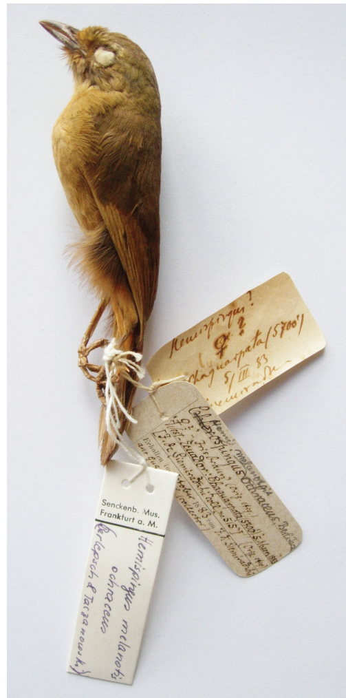
Figure 1. Lateral view of SMF 58282, the only surviving syntype of Sphenopsis ochracea (von Berlepsch & Taczanowski, 1884), collected by Siemiradzki at Chaguarpata, Chimborazo, Ecuador, on 5 March 1883. The original field label reads: ‘ Hemispingus? / ♀? / Chaguarpata (5700’) [= 1,737 m] / 5/III 83 / Siemiradzki’. The identification on the secondary (Berlepsch) label reads: ‘ Chlorospingus [in black ink] ochraceus , Berl. & Tacz. [in pencil]’, with ‘ Chloro ’ crossed out and replaced by ‘ Hemi ’ in pencil, and ‘ melanotis ’ in pencil

Several points of confusion have arisen from the analyses of García-Moreno et al. (2001), which demand explanation. Rensen (2007) quoted this paper in SACC Proposal 284: ‘Within our limited sampling, we could not detect any differences to warrant separation of the east- and west-slope subspecies melanotis and ochraceus , neither at the molecular level nor based on the plumage characters’ (García-Moreno et al. 2001). However, this statement was unfounded because the S. ochracea samples in their study (MECN 5265 and 5267) were evidently not included in their morphological or phylogenetic analyses. Both vouchers were juveniles (i.e., unsuitable for analysis of plumage colour in adults) and deposited at MECN (N. Krabbe in litt. 2022); they were therefore unavailable to García-Moreno et al. (2001), whose morphology analysis was based on ‘[vouchered adult] specimens from the National Museum of Natural History (Stockholm) and [the Zoological Museum, Natural History Museum of Denmark] ZMUC’ (both of which lack specimens of S. ochracea ). Furthermore, although the MECN samples were mentioned in the Methods and Discussion sections, they were absent from all phylogenetic analyses presented in the Results, including the table of genetic distances (see Figs. 2–4 and Table 1 in García-Moreno et al. 2001). Omission of these samples, and the ‘undescribed’ sample discussed below (ZMUC 104925), may also explain why they