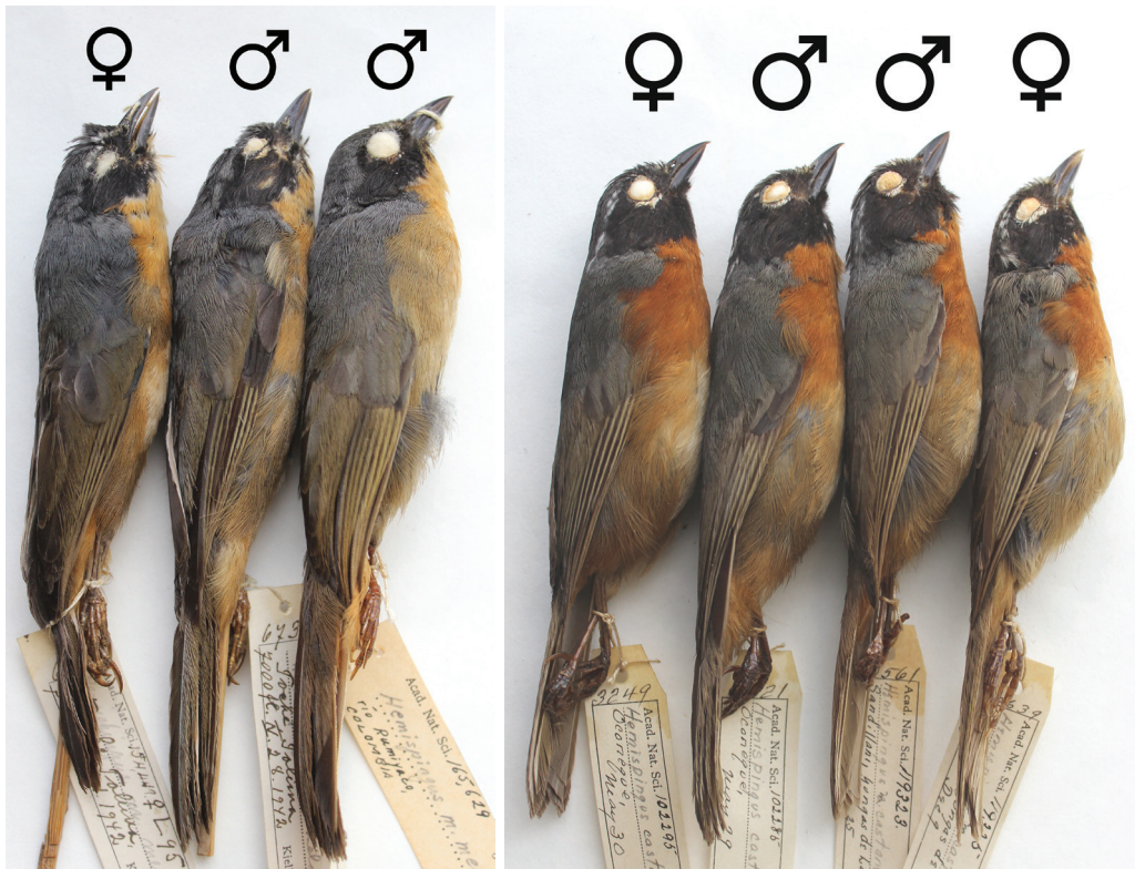
Figure 3 (left). Lateral view of (Northern) Black-eared Hemispingus Sphenopsis melanotis melanotis (P. L. Sclater, 1855). From left to right, (1) ANSP 154444, adult female prepared by Kjell von Sneidern on 25 April 1942 at 'Toche, Tolima, Colombia'. (2) ANSP 154443, adult male, prepared by Kjell von Sneidern on 28 April 1942 at 'Toche, Tolima, Colombia'. (3) ANSP 165629, adult male, collected on 30 November 1950 on the 'Rio Rumiayaco, [Nariño] Colombia' (Matthew R. Halley)