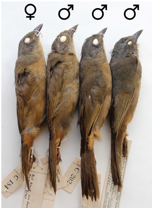
Figure 7. Lateral view of Western Hemispingus Sphenopsis ochracea (von Berlepsch & Taczanowski, 1884). From left to right, (1) DMNH 85570, adult female prepared by Fred C. Sibley on 12 June 1976 at ‘Chiriboga, km. 45, Quito-Santo Domingo (Old Rd.) 2000 m, Pichincha, Ecuador’. YPM field series = C 184. (2) DMNH 59270 (YPM N-604), adult male, prepared by Keith B. Aubry on 15 August 1976 at ‘Chiriborga [= Chiriboga], 2000 m, Old Quito-Santo Domingo Rd., Pichincha, Ecuador’. At the time it was prepared, the bird weighed 21.5 g and had enlarged testes (‘5 mm’). (3) DMNH 85569, adult male, prepared by Fred C. Sibley on 12 June 1976 at ‘Chiriboza [= Chiriboga], km. 45, Quito-Santo Domingo (Old Road) 2000 m, Pichincha, Ecuador’. YPM field series = C 202. When prepared, the bird weighed 16 g and testes were not enlarged (‘1 mm’). (4) ANSP 149722, adult male, prepared by Kjell von Sneidern on 3 April 1941 at ‘Mayasquer, Nariño, Colombia, Pac[ific] side / 7800 ft.’ [=2,377 m] (Matthew R. Halley)