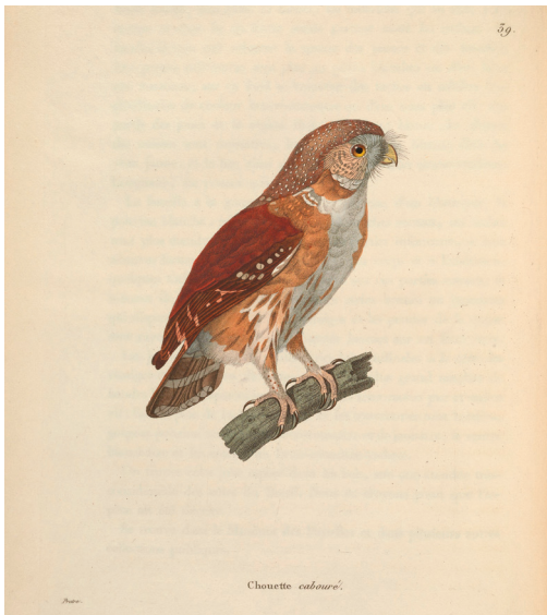
Figure 2 (above left). The illustration published by Levaillant (1799).