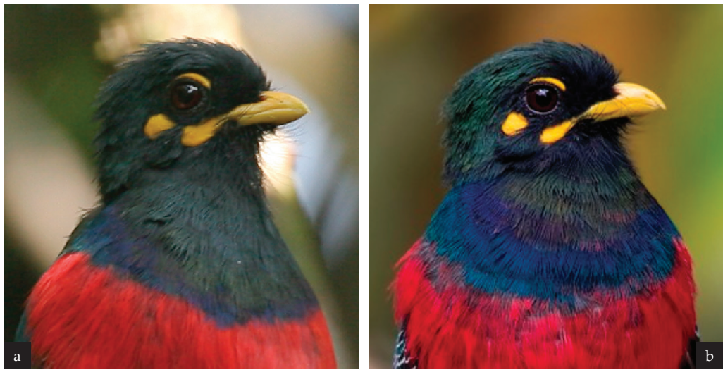
Figure 3. Bill colour and bare facial skin in male Bar-tailed Trogons Apaloderma vittatum , (a) Obudu Plateau, Nigeria, December 2004, (b) Bioko, February 2019

chin to mid-belly and hence slightly smaller pink belly patches than Central and Western females (Table 1). Eastern birds have longer wings and tails than Central birds, which in turn have longer wings and tails than Western birds (Table 1). It is curious that Central birds have slightly shorter bills than Eastern and Western birds; the fact that both sexes show this suggests the difference is real. It is also curious that in many photographs Eastern birds appear to have smaller bills than either Central or Western birds; this seems to be the product of the latter having less feathering at the base of the mandible.