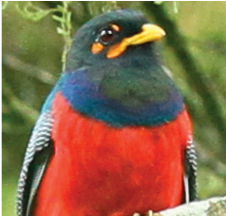
Figure 4. Male Bar-tailed Trogon Apaloderma vittatum showing yellow supraocular mark (spot or line?), Buhoma, Uganda, October 2013

chin to mid-belly and hence slightly smaller pink belly patches than Central and Western females (Table 1). Eastern birds have longer wings and tails than Central birds, which in turn have longer wings and tails than Western birds (Table 1). It is curious that Central birds have slightly shorter bills than Eastern and Western birds; the fact that both sexes show this suggests the difference is real. It is also curious that in many photographs Eastern birds appear to have smaller bills than either Central or Western birds; this seems to be the product of the latter having less feathering at the base of the mandible.