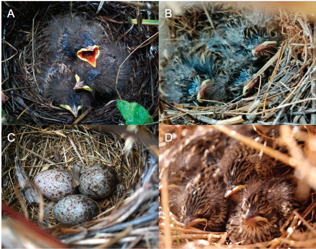
Figure 2. Nests of Hellmayr's Pipit Anthus hellmayri dabbenei in central Chile: (A) N1, Bulnes, with three nestlings c.8 days old; (B) N2, Los Sauces, with three nestlings c.10 days old; (C) N3, Los Sauces, with three eggs; (D) N4, Los Sauces, with four nestlings c.12 days old

treated these as independent feeding events, whereas calls separated by <5 seconds were considered the same feeding event, as this was the min. interval between deliveries detected using the trail camera.