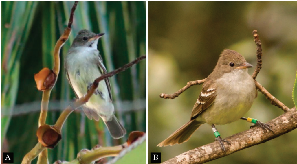
Figure 2. (A) Noronha Elaenia Elaenia ridleyana, Atol das Rocas, 16 June 2021 ; (B) Fernando de Noronha, 20 June 2021; an individual banded by the project Aves de Noronha