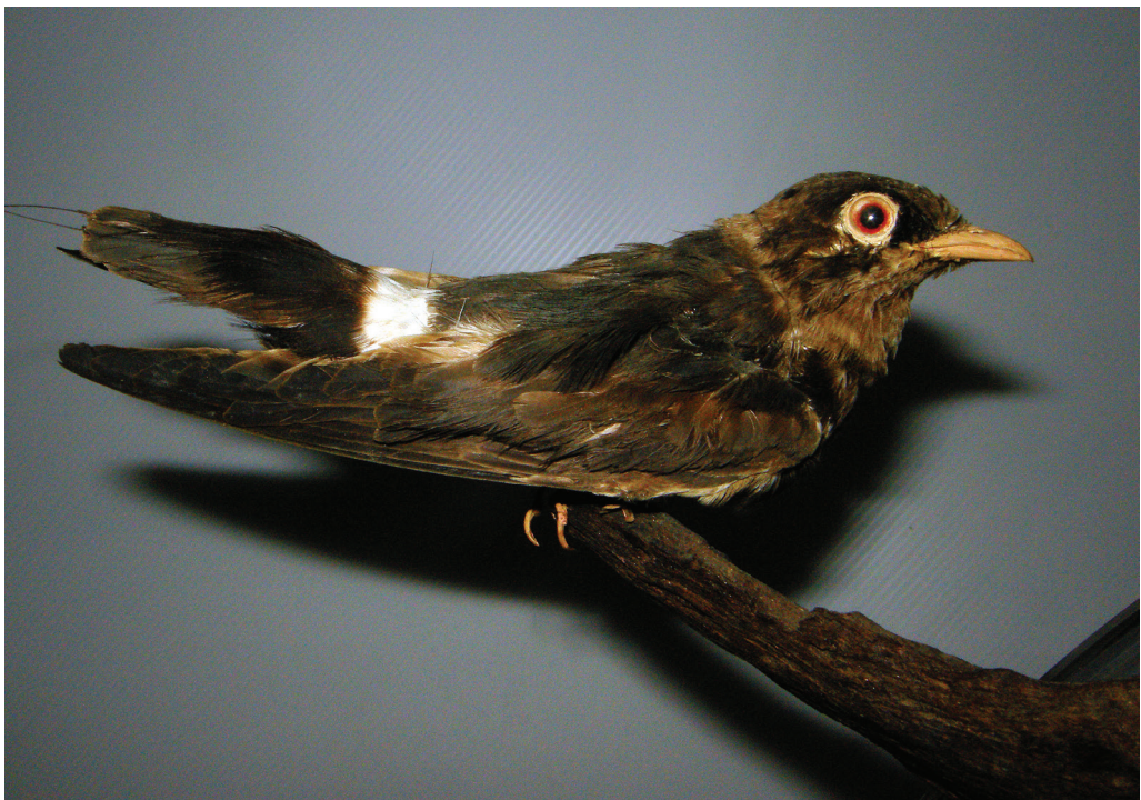
Figure 12 (below). Mounted specimen of White-eyed River Martin Pseudochelidon sirintarae in the Director's office of the Zoological Parks Organization in Bangkok; probably a composite of the former live birds kept at Dusit Zoo in 1971