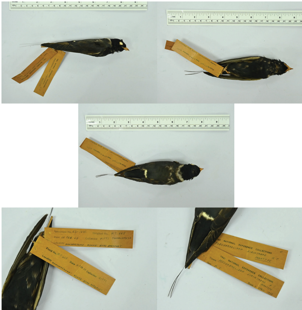
Figure 3. Adult White-eyed River Martin Pseudochelidon sirintarae of unknown sex, paratype THNHM B-07479, collected 10 February 1968

is unknown, and it cannot be located. Two additional skins from this date are in THNHM: B-07479 (formerly ASRCT 53-1221, collector's number KT 665), an adult of unknown sex with moderate tail-streamers (Fig. 3; trunk in spirit at THNHM); and THNHM B-02379 (formerly ASRCT 53-1222, collector's number KT 667), which is said to be an immature (Thonglongya 1968a), presumably because of the greyish throat, but also has broken tail-streamers of which only 2/3 remain (P. D. Round in litt. 2022; Fig. 4; trunk in spirit at THNHM). Both are paratypes.