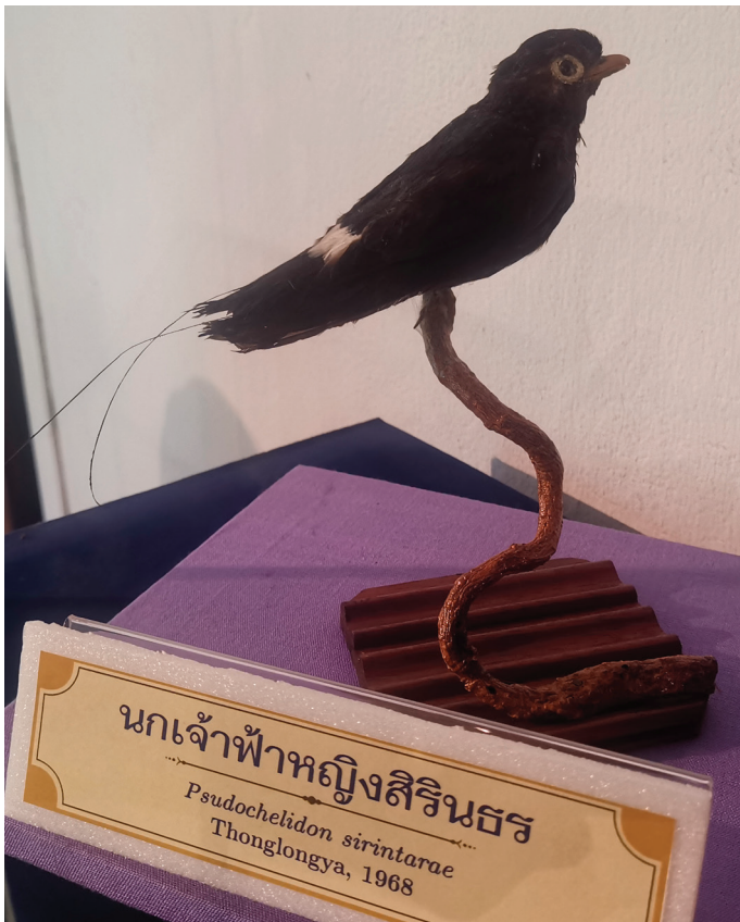
Figure 11 (left). Mounted specimen of White-eyed River Martin Pseudochelidon sirintarae at the Chulalongkorn University Museum of Natural History, with no data; it may be a composite or made from other hirundines, and further investigation is needed