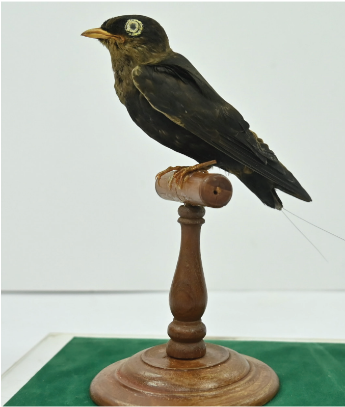
Figure 9 (left). A mounted specimen (THNHM B-07481) of White-eyed River Martin Pseudochelidon sirintarae believed to be the bird collected in November 1968

Figure 10 (below). Mounted specimen of White-eyed River Martin Pseudochelidon sirintarae at the Chulalongkorn University Museum of Natural History, with no data, photographed in 2013; like the other mounted specimen (Fig. 11), it may be a composite or mock-up incorporating parts from other hirundines