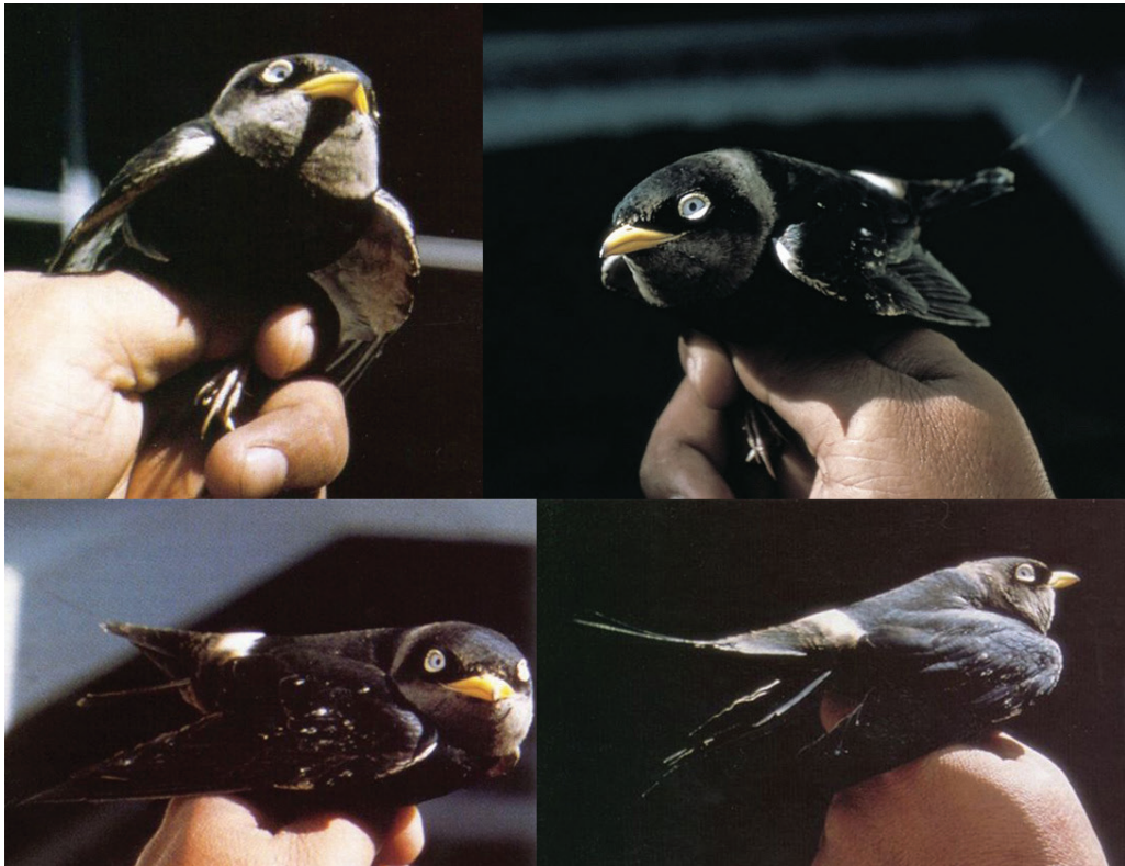
Figure 13. Photographs of the White-eyed River Martin Pseudochelidon sirintarae caught in November 1968 published by Tobias (2000) and deposited in the Macaulay Library, Cornell University; the bird is presumably an adult given the presence of tail-streamers and is believed to be THNHM B-07481

Two other photographs, clearly of the same individual, appear to have gone unnoticed, despite appearing in McClure (1969) alongside a photograph of 'Princesses Sirindhorn and Chulaporn ( sic =Chulabhorn) watching Mr. Kitti removing a bird [not Pseudochelidon ] from a mist-net' (Figs. 14–15) The bird was reportedly not released, although whether it