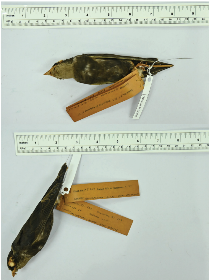
Figure 4 (left). Immature White-eyed River Martin Pseudochelidon sirintarae of unknown sex, paratype THNHM B-02379, collected 10 February 1968