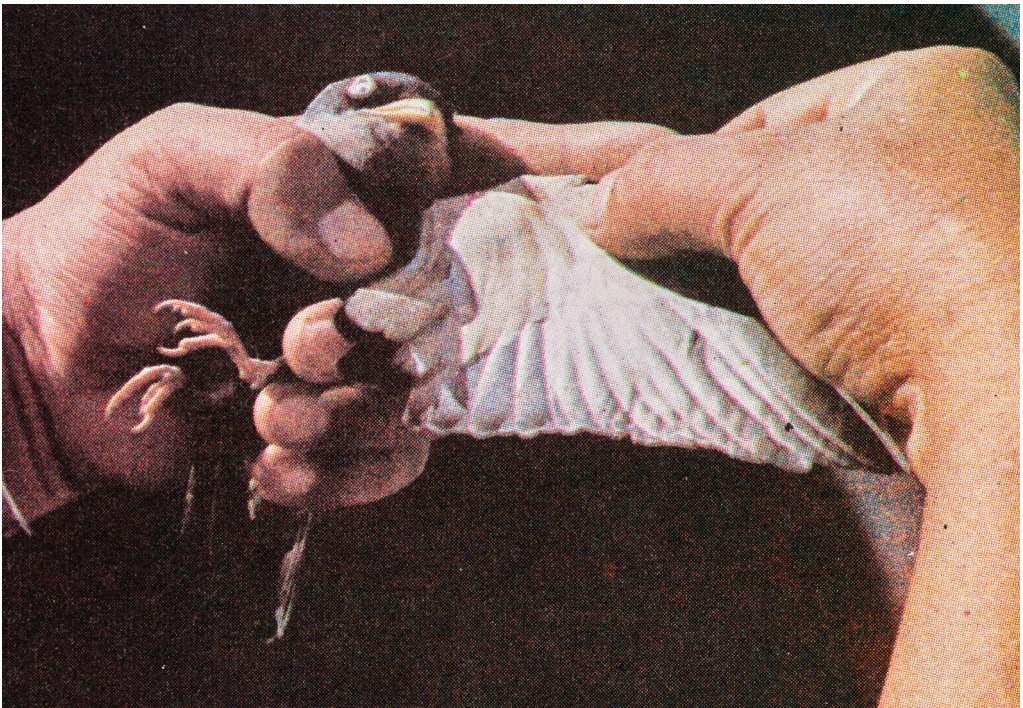
Figures 14–15. Photographs of the White-eyed River Martin Pseudochelidon sirintarae caught in November 1969; presumably an adult given the presence of tail-streamers. (H. E. McClure; originally published in McClure 1969).