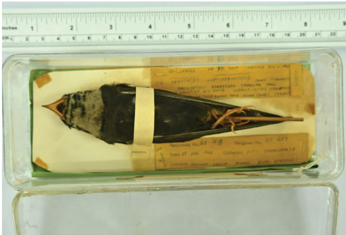
Figure 1 (left). Immature male White-eyed River Martin Pseudochelidon sirintarae , paratype THNHM B-07478, collected on 28 January 1968