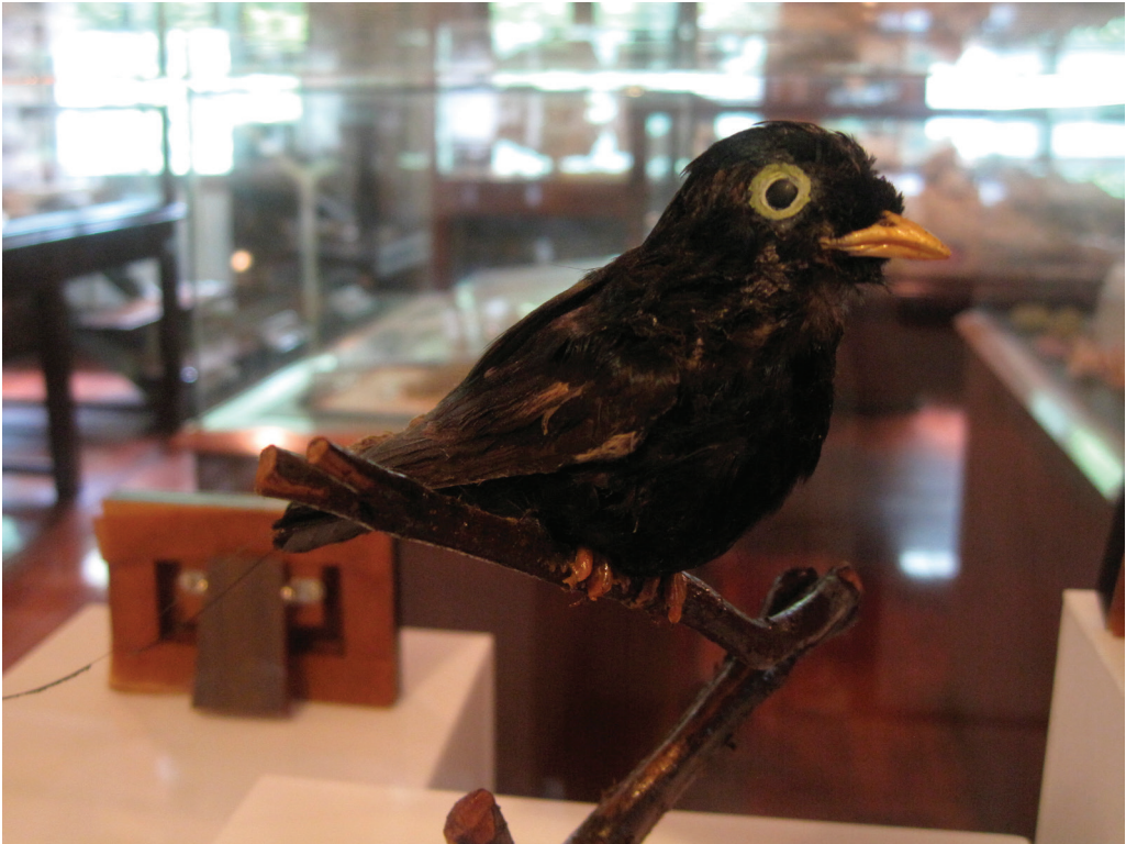
Figure 10 (below). Mounted specimen of White-eyed River Martin Pseudochelidon sirintarae at the Chulalongkorn University Museum of Natural History, with no data, photographed in 2013; like the other mounted specimen (Fig. 11), it may be a composite or mock-up incorporating parts from other hirundines