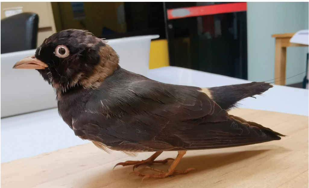
Figure 5 (below). Former spirit specimen of an immature White-eyed River Martin Pseudochelidon sirintarae of unknown sex, paratype THNHM B-07480, collected on 10 February 1968; it was mounted in the mid-2010s