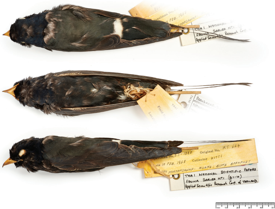
Figure 8. Adult White-eyed River Martin Pseudochelidon sirintarae of unknown sex, paratype NHMUK 1968.68.1, collected on 10 February 1968; the trunk is in spirit (USNM 510427; see Fig. 8)

One featherless body from an adult (with the syrinx preserved and trunk dissected) is in spirit at the National Museum of Natural History, Smithsonian Institution (USNM 510428; formerly ASRCT 53-1224, collector's number KT 668; Fig. 7) and is a paratype. The date on the label, 14 February 1968, we believe to be incorrect.