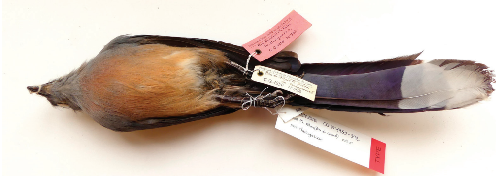
Figure 1. Holotype of Coua cristata maxima (MNHN-ZO-1950-392) in ventral view; note the loss of all undertail-coverts (Guy M. Kirwan)

which he collected at Fort Dauphin (now Taolagnaro or Tolagnaro), in far south-east Madagascar, on 18 February 1948 (Milon 1950); he later mentioned that he found it in humid forest (Milon 1952). He diagnosed it (in French; all quotations from the original description are our translations) on the basis of both size and colour. As its name indicates, the holotype in the Muséum national d'Histoire naturelle, Paris (MNHN-ZO-1950-392; Figs. 1–5), proved larger than the largest of the known subspecies of Crested Coua C. c. pyropyga (in the following sequence of measurements, in millimetres, maxima is first vs. pyropyga , with the latter's values expressed as means of 14 specimens): bill (from commissure) 30.0