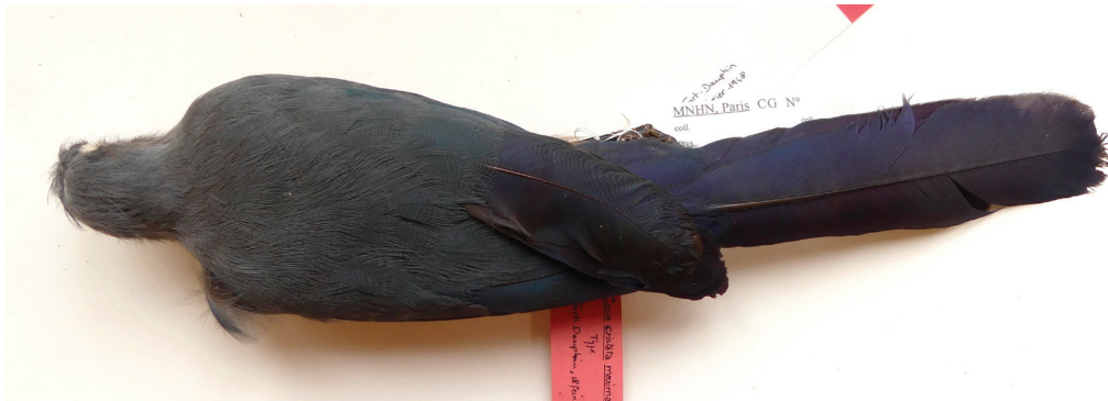
Figure 3. Holotype of Coua cristata maxima (MNHN-ZO-1950-392) in dorsal view (Guy M. Kirwan)