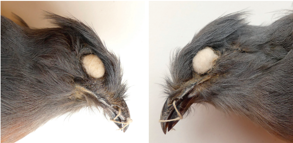
Figure 4 (left). Holotype of Coua cristata maxima (MNHN-ZO-1950-392), view of right side of head (Guy M. Kirwan)