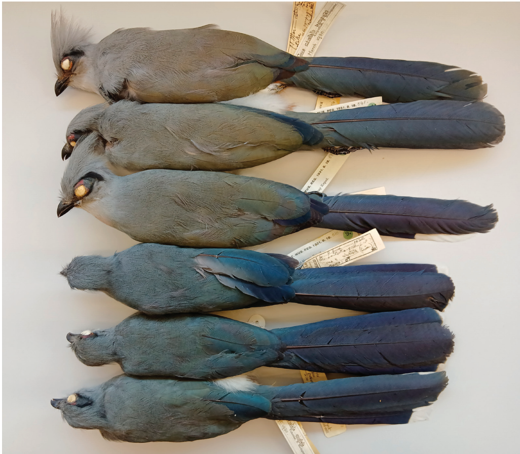
Figure 12. Dorsal view of the same three Coua [crystata] pyropyga and three C. c. cristata specimens, as in Fig. 11, in the Natural History Museum, Tring, top to bottom: NHMUK 1931.8.18.542, NHMUK 1931.8.18.541, NHMUK 1931.8.18.536, NHMUK 1931.8.18.510, NHMUK 1931.8.18.513, NHMUK 1931.8.18.515

than that it shared white ones with nominate cristata ; and (3) the known distance between the type locality of maxima and the easternmost occurrence of pyropyga is far smaller.