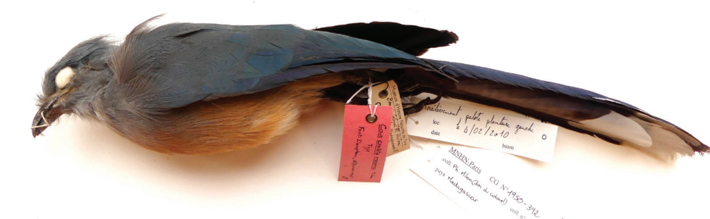
Figure 2. Holotype of Coua cristata maxima (MNHN-ZO-1950-392) in lateral view (Guy M. Kirwan)