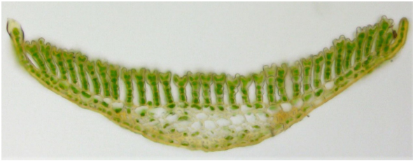
Figure 1. A leaf cross section showing the leaf anatomy of Polytrichaceae with lamellae and the forked terminal cells, which are diagnostic for Polytrichum commune . This section is the best result out of three trials with the magnetic sectioning aid by someone who had never sectioned a bryophyte before. In all three trials, sections with clearly recognisable diagnostic features were present.

Application of the method is demonstrated in an instructional video in the supplementary material, which may help to harness the magnetic aid for teaching and personal use. Sectioning starts with the positioning of a standard microscope slide on the support plate in the area between the six central tongues. This prevents the slide from gliding away during sectioning and correctly aligns it with the lateral non-magnetic strip. On this lower slide, a