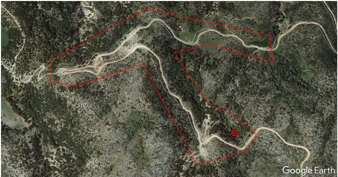
Fig. 1: Satellite image of Perganti Mt. covering the type locality of Zelotes acarnanicus sp. n. The area sampled for spiders is enclosed by the red line and covers approximately 25 hectares of rock-steppe and phrygana habitat situated 950-1060 m above sea level. Most specimens at this locality were sampled near the red circle (38.8314°N, 20.9750°E)