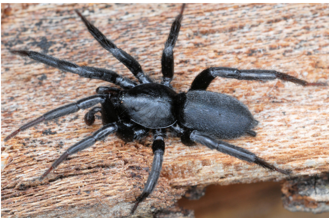
Fig. 2: Zelotes acarnanicus sp. n. Habitus of holotype

uted as in Fig. 3c. Sternum ovoid, truncated anteriorly, very slightly projecting between coxae IV. Maxillae constricted at middle. Labium ligulate, about twice as long as wide.