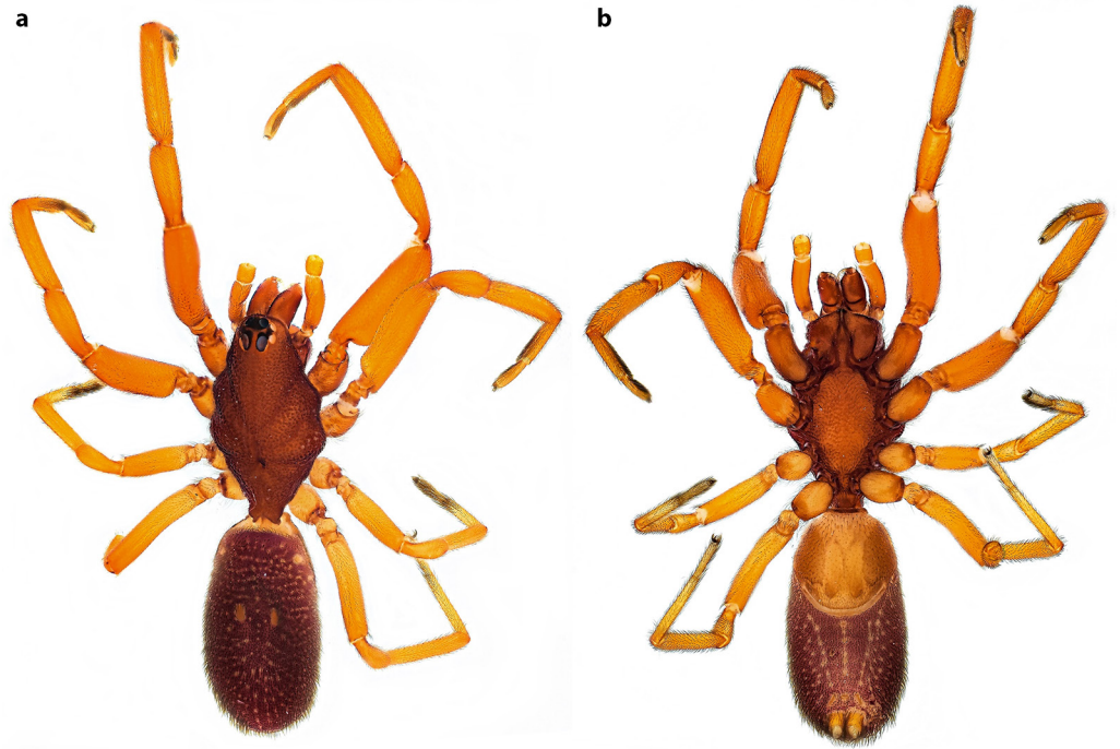
Fig. 1: Stenochilus hobsoni , male habitus, a. dorsal view, b. ventral view

mily) extends the range of the species 3000 km to the west (Fig. 3).