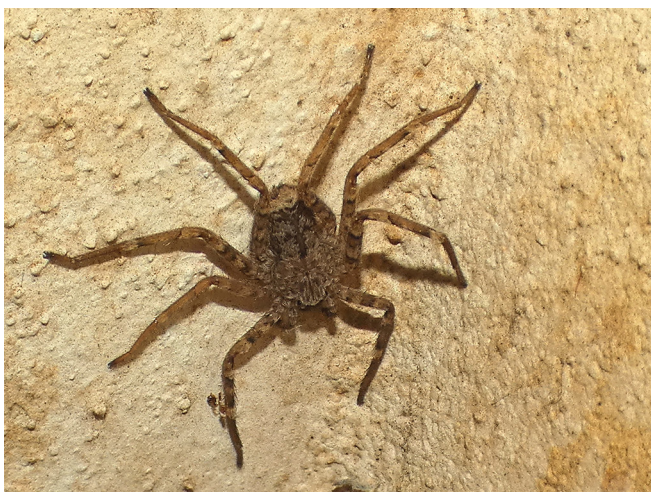
Fig. 3: One of at least six different individuals of S. radiatus observed inside the same inhabited house on the island of Filicudi (Aeolian Archipelago) in October 2023.

Most individuals were observed inside or around inhabited houses (Fig. 3), just like the first record in Sicily (Lo Cascio & Grita 2010). This is in accordance with many observations from the Afrotropical region (Lawrence 1940, Corronca 2000, 2002). Our data clearly demonstrate the synanthropic habits of this species. In addition, Lawrence (1940) described the genus as being attracted by light and to be found resting on inside walls at night, which might further explain why it is frequently observed by citizens, but rarely collected by scientists.