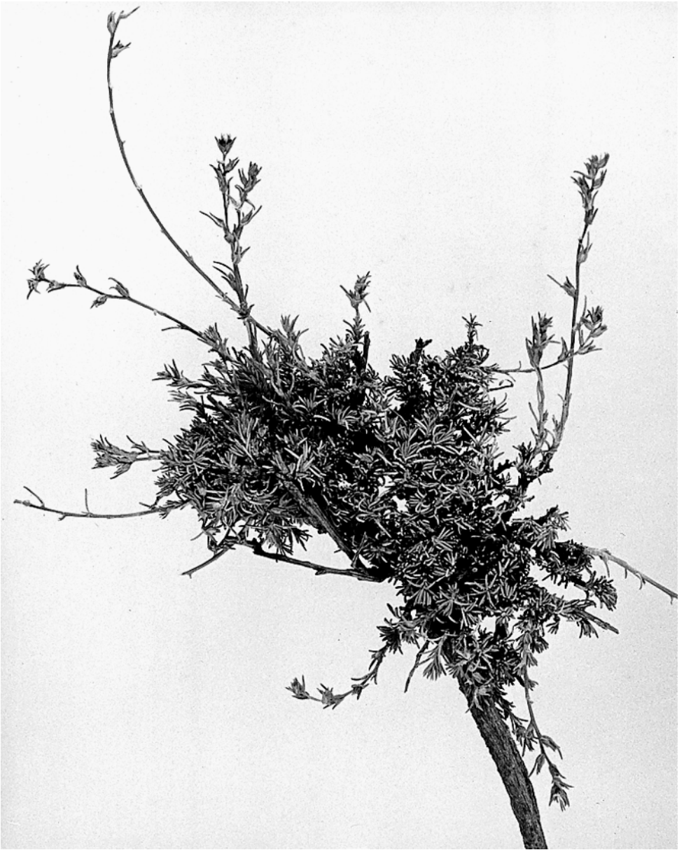
Fig. 1. Salsola canescens subsp. serpentinicola Freitag & E. Özhatay (holotype, ISTE 51123).

subsp. canescens still at hand from the Salsola account for “Flora iranica”, the SW Anatolian plants proved to be sufficiently distinct to give them, at least, subspecific rank. We hesitated to describe them as a new species because all differences except the length of anther appendages could well be induced by the peculiar habitat conditions. This refers in particular to the subulate leaves of subsp. serpentinicola (Fig. 2D), because similar thick and stiff leaves have been seen in a few specimens of subsp. canescens from dry localities in N Iran.