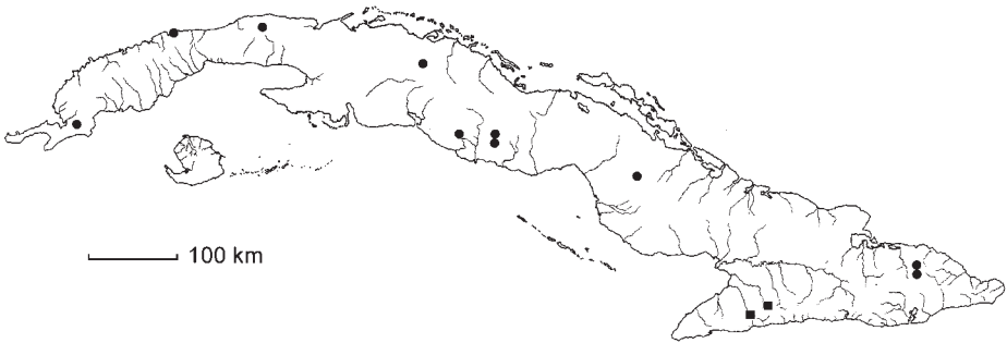
Fig. 3. Map showing the total known distribution of Wallenia bumelioides (dots) and W. maestrensis (squares).

Distribution: Endemic to the Sierra Maestra, E Cuba (Fig. 3). Growing in cloud forest (monte nublado) on yellowish-red mountain soil, at altitudes of 900-1974 m a.s.l.