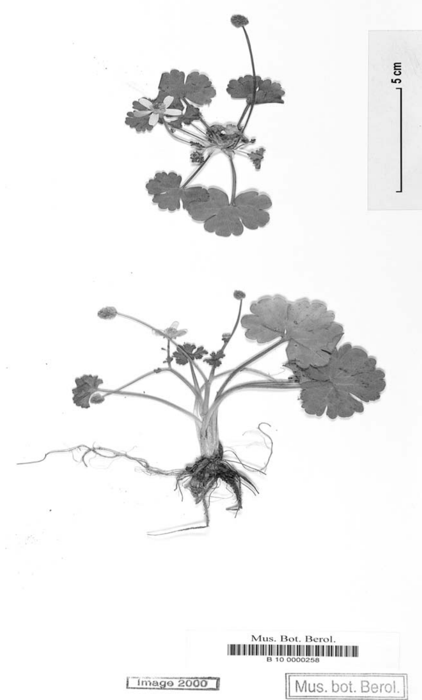
Fig. 2. Ranunculus veronicae – plants of the holotype sheet (Böhling 7066) at B.