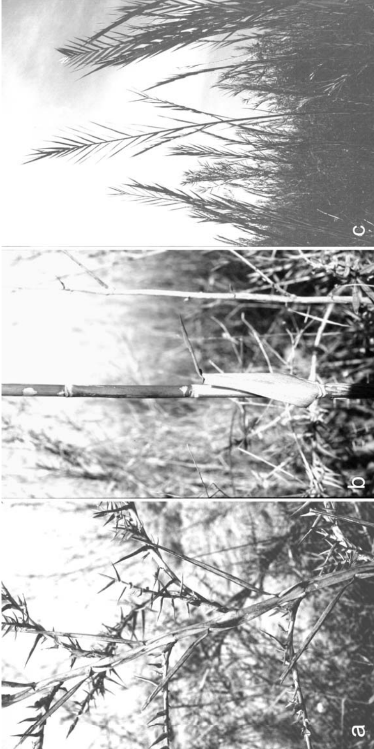
Fig. 2. Phragmites frutescens – a: mature main stem with sterile side branches, loose leaf sheaths and totally abscising leaves; b: mature stem being naked (after natural abscission of mature lower leaves), shiny, suffused with red, woody; c: phoenicoid shoots, grown up to c. 4 m tall culms with 3 cm diameter at base (in first season), partly with sylleptic branching. –, a: Greece, Crete, Asproutiani, 16.4.1998, b: ibid. 9.11.1998, c: Greece, Chalkidiki, Sithonia peninsula, between Neas Marmaras and Lagomandra, 20.9.1999.