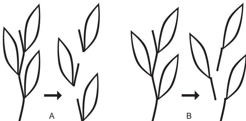
Fig. 1. Aegilops , schematic presentation of two modes of spike disarticulation – A: spike disarticulating in dispersal units of the “barrel type”; B: spike disarticulating in dispersal units of the “wedge type”.