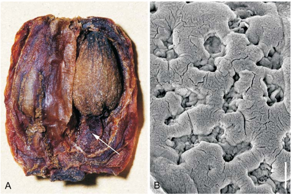
Fig. 3. Gorgonidium beckianum – A: berry, one locule opened to show the single ovoid, orthotropous seed with the funicle (arrow) still attached to the axile placenta; photograph from Kessler & al. 4823 (LPB) by G. Gerlach; B: exine of pollen grain, fissures in reticulum artificial by preparation; SEM micrograph by H. Halbritter.