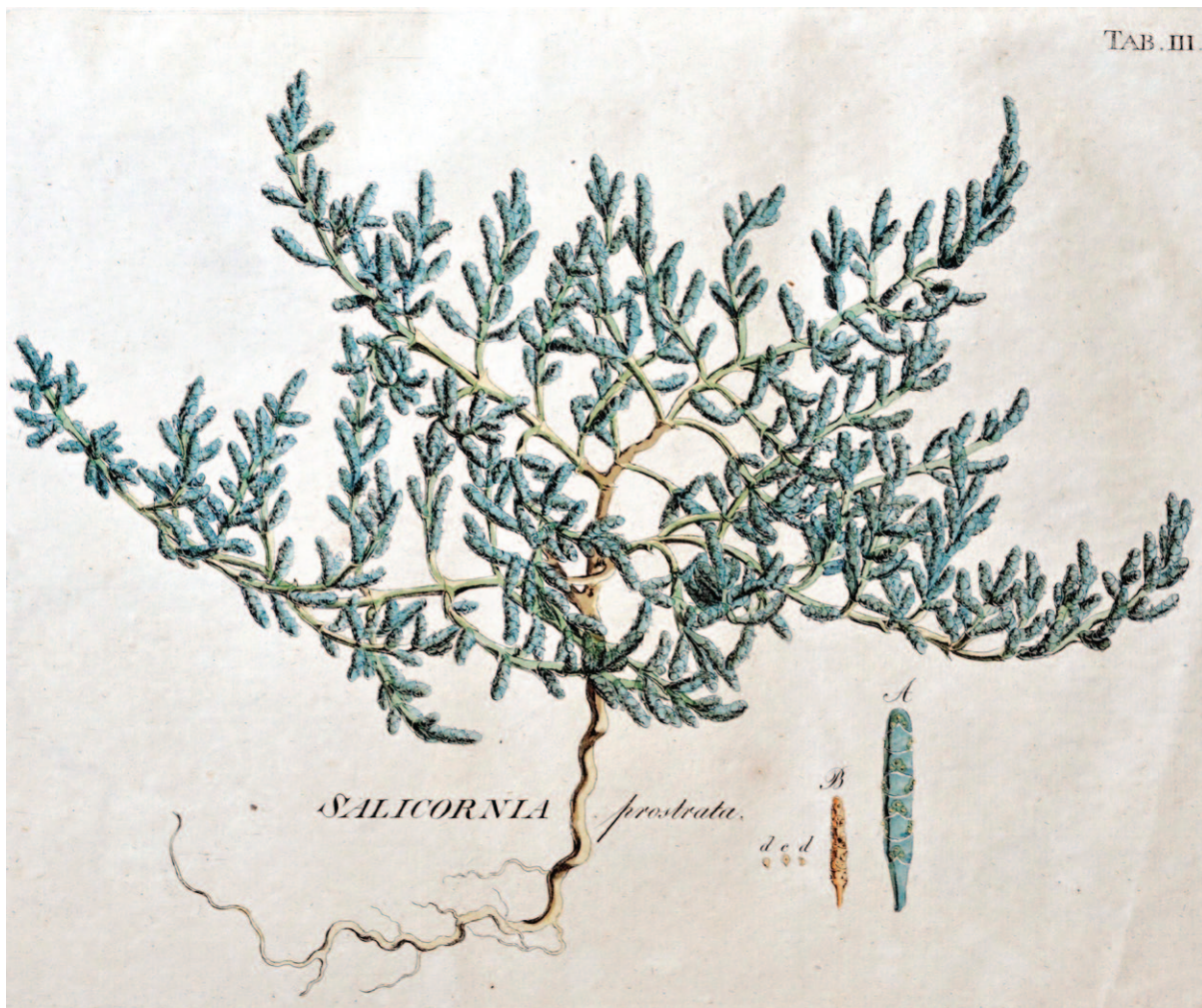
Fig. 2. Illustration of Salicornia prostrata Pall. (Pallas 1803: t. 3).

(1995), Tzvelev (1996) and Sukhorukov (2006) agree that the diploid populations in SE Russia and W Kazakhstan, which generally can be separated from the tetraploids by the smaller anthers (0.25–4 mm), shorter spikes (up to 3–4 cm) and thinner central cylinders (König 1960), belong to one species. It is named Salicornia herbacea , S. europaea , S. prostrata or S. perennans , with the first and the third name being synonyms. Only Pallas (1803) recognised three species, raising his S. herbacea var. \beta to species rank as S. prostrata , re-naming the erect growing plants as S. acetaria and describing the new species S. pygmaea . However, the last species was later recombined as Halopeplis pygmaea (Pall.) Bunge ex Ung.-Sternb. As far as is known to us, Salicornia was never critically studied in the area under review. Therefore, our observations about the variability of Salicornia gained during an expedition also aimed at studying the annual salt-marsh communities of the Caspian lowlands in 1996 (Freitag & al. 2001: 70–71), merit some discussion.