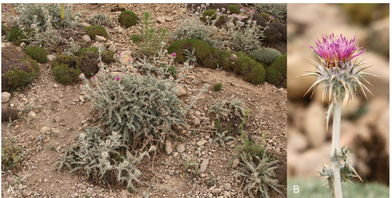
Fig. 2. Cousinia saloukensis at its type locality – A: mature individuals along with young plants; B: flowering head.

Systematic affinities — Morphologically Cousinia saloukensis is most similar to C. polyneura Rech. f. of C. sect. Eriocousinia from eastern Afghanistan. This lat-