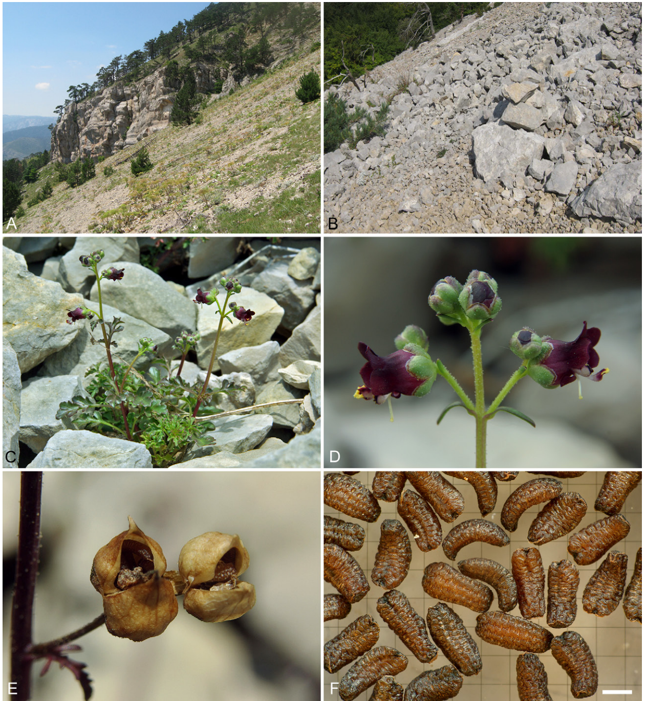
Fig. 1. Scrophularia exilis and its habitats – A: habitat at Djunyn-Kosh; B: habitat at Shagan-Kaya (mobile part of the scree); C: general aspect of a flowering plant; D: flowers and buds; E: capsules; F: seeds. – Scale bar = 1 mm. – Photographs by A. Fateryga (A), A. Nikiforov (B) and S. Svirin (C–F).

In 2012, we were successful in rediscovering Scrophularia exilis in its type locality, as well as in a second locality, and in collecting new material for the first time since the collection of the type specimens in 1929. The purpose of this paper is to give the diagnostic characters of S. exilis according to our new data, to establish its differences from S. heterophylla subsp. laciniata , to ascertain coenotic conformity of the species and to provide an updated key to the species of Scrophularia in the Crimean flora.