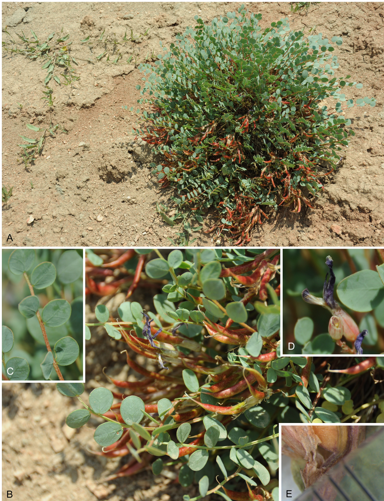
Fig. 1. Astragalus ihsanalisii – A: habit of fruiting plant; B: leaves and infructescences; C: part of leaf, adaxial surface; D: flowers, one truncated; E: stipe of legume. – Type locality, 26 June 2015, photographed by A. A. Dönmez.