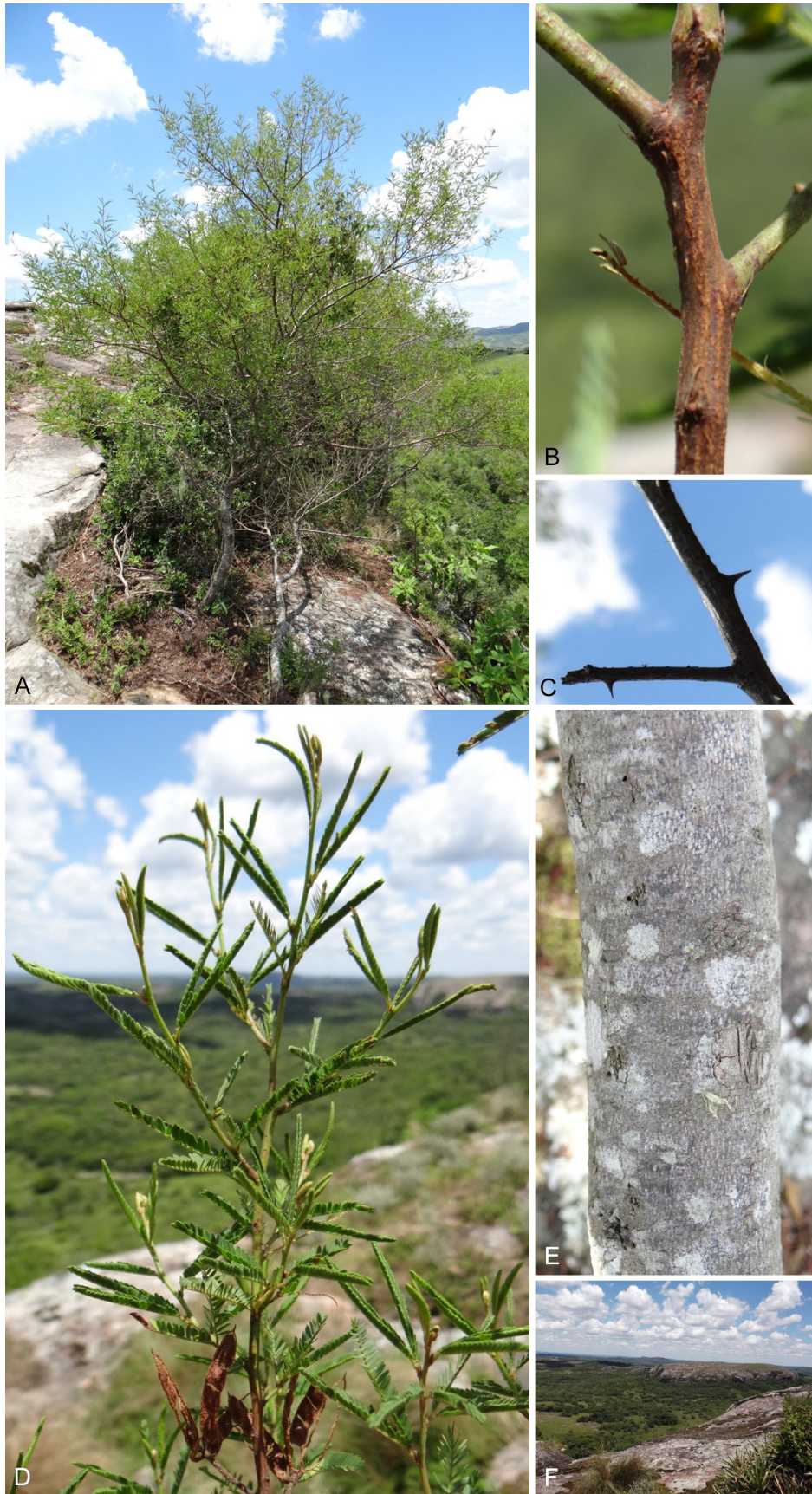
Fig. 1. Morphology and habitat details of Mimosa subinermis . – A: habit and habitat; B: indumentum of old branch; C: aculei; D: leaflets closed at midday; E: trunk; F: habitat. – Brazil, Rio Grande do Sul, Caçapava do Sul, Cerro das Mulas, 11 December 2015; photographs: A–E by D. B. Lucas; F by F. Schmidt Silveira.