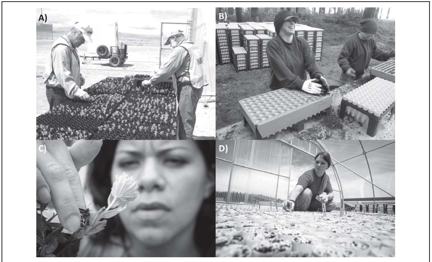
Figure 2. Prison inmate technicians participating in conservation projects. (A) Adults in custody cultivating sagebrush ( Artemisia tridentata ) at Snake River Correctional Institution near Ontario, Oregon. Plants produced at this facility are planted by inmate work crews at restoration sites to improve habitat for greater sage-grouse ( Centrocercus urophasianus ) (photo by Stacy Moore). (B) Production of early blue violet ( Viola adunca ) at the Coffee Creek Correctional Facility to support habitat restoration and feeding of captive reared Oregon silverspot butterflies ( Speyeria zerene hippolyta ) (photo by Thomas Kaye). (C) An inmate with SPP-Washington Taylor's Checkerspot Captive Rearing Program at Mission Creek Corrections Center for Women holds an endangered Taylor's checkerspot butterfly ( Euphydryas editha taylori ) next to golden paintbrush ( Castilleja levisecta ) during a study of the butterfly's oviposition preferences (photo by Benj Drummond). (D) An inmate technician labels native prairie plants for the SPP-Washington Conservation Nursery Program at Washington Corrections Center for Women (photo by Benj Drummond).

Coffee Creek Correctional Facility for women, a medium- and minimum-security prison in Wilsonville, Oregon (Figure 2B). Violet plants are also grown at the Oak Creek Correctional Facility for young women in Oregon, a facility managed by the Oregon Youth Authority. This project is a partnership between the Oregon Department of Corrections, Institute for Applied Ecology, Oregon Youth Authority, and the Oregon Zoo. A lecture series on habitat and animal conservation is provided to inmates in the women's prison and young women receiving high school science classes at the youth facility. Biologists from the Institute for Applied Ecology work closely with the staff and offenders at both correctional facilities to ensure proper cultivation practices for the violet