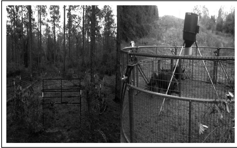
Figure 3. Examples of remotely activated corral traps and captured wild pigs in a remotely operated trap at the Savannah River Site, South Carolina, USA, 2015–2016.