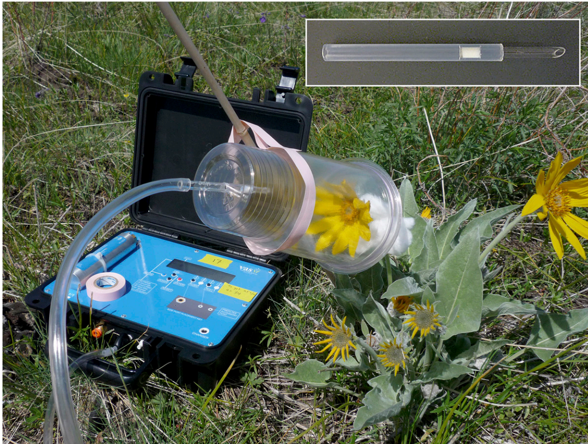
Fig. 2. Collecting VOCs from flowers of arrowleaf balsamroot ( Balsamorhiza sagittata (Pursh) Nutt.) in the field. This setup is being used by the authors to study the effects of environmental change on floral scent and pollinator attraction. The inset shows a volatile collection trap containing a bed of the adsorbent HayeSep Q. Details of this setup are provided in Appendix 1.