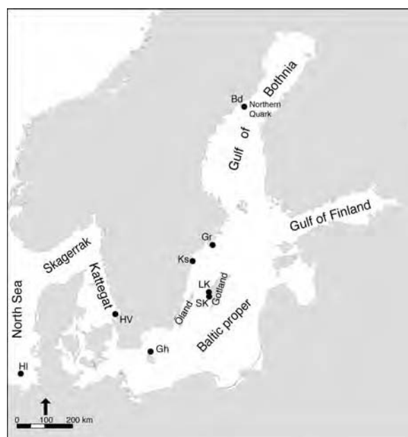
Figure 1. Map of the Baltic Sea and adjacent sea areas, with geographical names mentioned in the text. Bd Bonden, Gh Gräsholmen, Gr Grän, Hl Helgoland, Hv Hallands Väderö, LK Lilla Karlsö, SK Stora Karlsö and Ks Källskären.

duals were landed at five occasions; 11 November 1987 (13 specimens), 28 October 1988 (4), 2 November 1988 (10), 29 November 1988 (50) and 14 November 1989 (72), respectively.