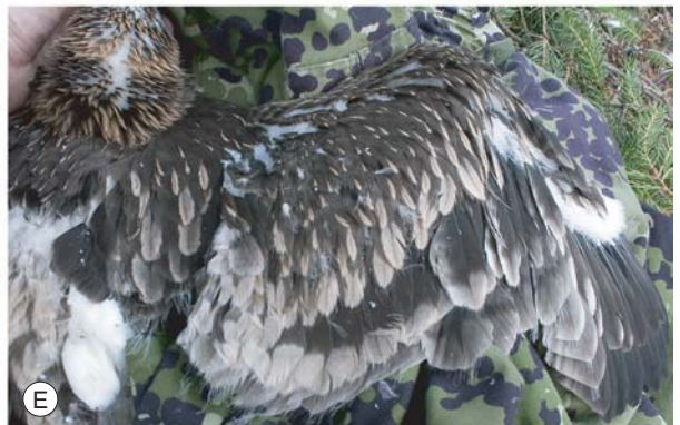
Appendix 1. Offspring of R7400 (backcrosses between F1 hybrid male and A. pomarina female) on 25 July 2006 (A–C) and on 15 July 2009 (D–E).