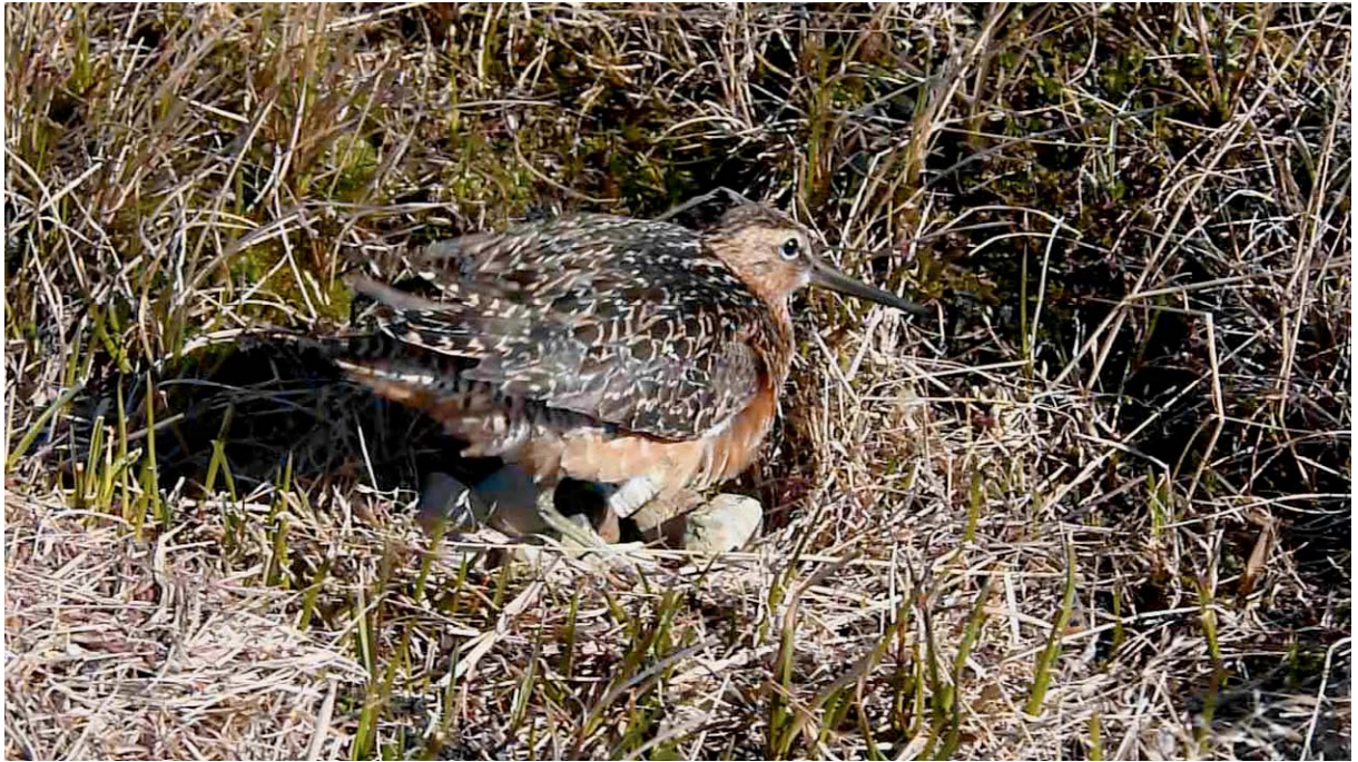
Figure 2. Still shot from video footage of the Long-billed Dowitcher flushing from the nest; video taken on 22 June 2011.

typical of shorebirds incubating a nest (Simmons 1952). The following day between 15:00 and 15:30 h we videotaped the bird with a digital camera from a minimum distance of 3 m as it incubated the nest and flushed when we approached (Figure 2). The bird flew only a few meters away from the nest and returned to it immediately once we moved away; seven minutes later we recorded a second video of the incubating bird.