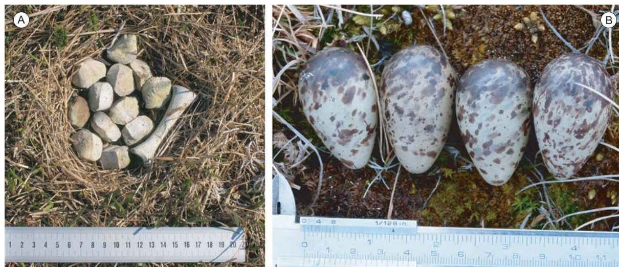
Figure 1. (A) The Long-billed Dowitcher ‘clutch’ of twelve intervertebral discs and one elongated bone of an unidentified mammal; photo taken on 26 June 2011. (B) Normal clutch from a Long-billed Dowitcher nest at the study site.

Upon our approach, the dowitcher flushed from the nest and displayed rodent run distraction behaviour