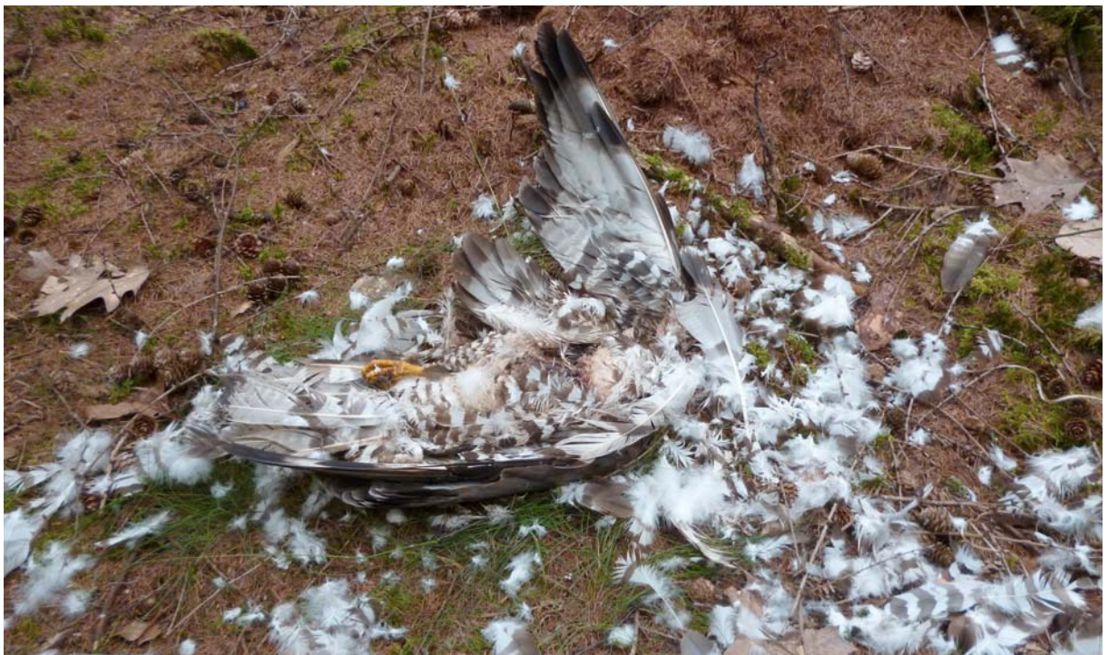
Adult male European Honey-buzzard killed and partly eaten by Northern Goshawk, underneath its nest in the forestry of Smilde, northern Netherlands, 17 June 2014, a regular sight in Dutch woodlands. Predation is the major mortality factor on Dutch breeding grounds.

The return of predators, in The Netherlands equating with a ten- to twentyfold increase in breeding numbers and distribution of many raptor species, had