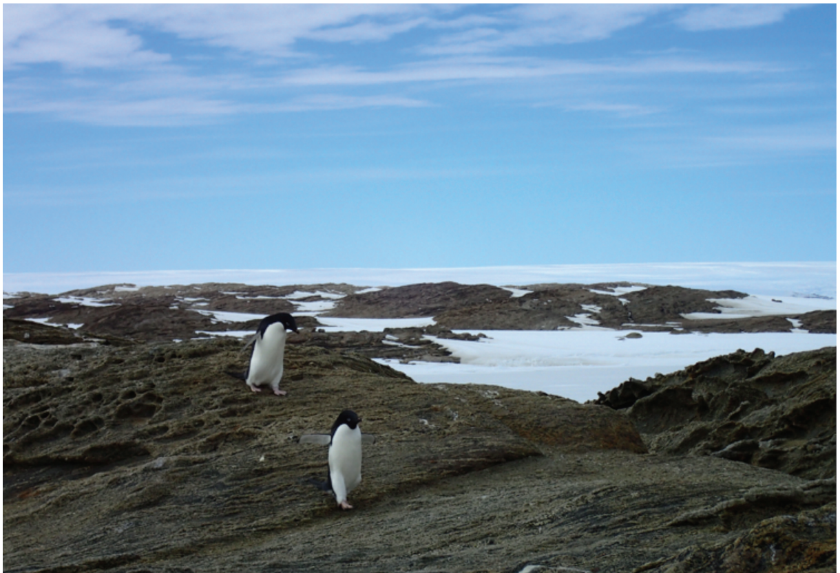
Adélie Penguins walking overland (12 December 2017, near a breeding colony in Lützow-Holm Bay in Antarctica).

Field experiments on Adélie Penguins were conducted on 17 January 2018 at the Hukuro Cove colony (Figure 1; 69.21°S, 39.63°E; 150–200 pairs) in Lützow-Holm Bay in Antarctica. This field site is about 23 km south of the Japanese Syowa (Showa) Station. Two Adélie Penguins breeding at this colony were caught by hand during the late guarding stage, during which one parent guards its chick at the nest, while the other forages at sea. Both nests had one chick. We caught the two birds just after they returned to their nest at the end of a foraging trip and before their mates left the nest to forage, thereby avoiding leaving the chick alone. The experimental birds were determined to be a