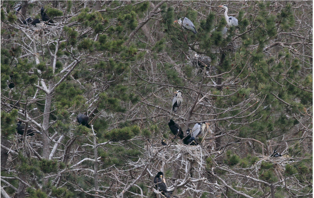
Mixed-species colony of Great Cormorants and Grey Herons at the study site in Aomori, Japan (19 April 2016).

'staying on nest' (a bird perched on its own nest or on a branch near the nest) or 'approaching the predator' (a bird left its own nest and perched on a branch near the predator). In addition, we considered alarm call and intimidation as aggressive behaviours. For the analysis, we used all birds that were within a 5-m radius of the predator when the predator appeared.