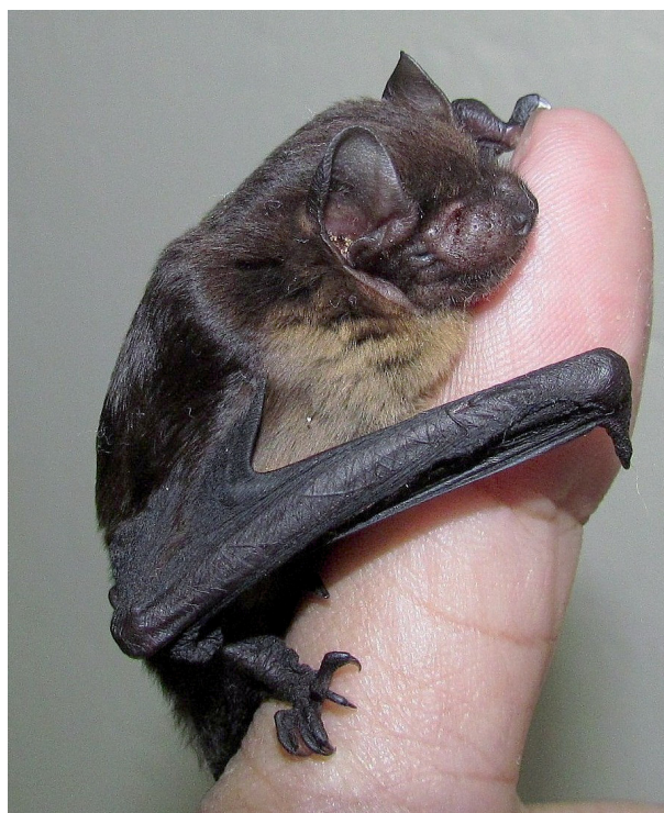
Fig. 1. Picture of the live adult male H. joffrei ZSI V/M/ERS/292. Note the dark brown, glossy appearance of the dorsal pelage, and the sharp demarcation between the dorsal and lighter ventral colour.

The preserved animal has long and narrow wings, much like those of Nyctalus spp., with the fifth digit being noticeably reduced (46 mm in total length) when