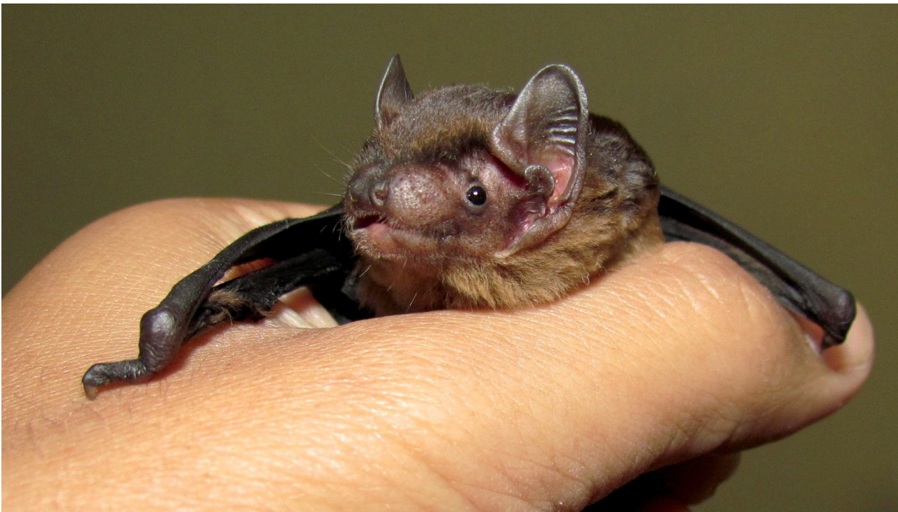
Fig. 2. Portrait of H. joffrei specimen ZSI V/M/ERS/292. Note the enlarged muzzle and short, roundish tragus.

lower canines are long and slender, and lack secondary cusps. The first lower premolar ( P_2 ) is slightly less in height than the second premolar ( P_4 ); both premolars are compressed in the toothrow. Contrary to all true Pipistrellus species, the lower molars in our specimen are myotodont which corresponds to the dental configuration found in Hypsugo (Horáček & Hanák, 1985-86).