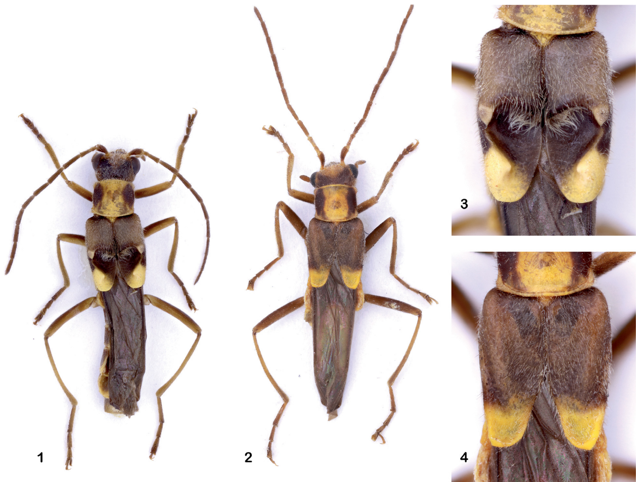
Figs 1-4. Paramaronius unituberculatus sp. nov. (1) Dorsal habitus of male (holotype, NMB). (2) Dorsal habitus of female (paratype, MZSP). (3) Detail of the elytra of male. (4) Detail of the elytra of female.

and legs light brown, darker on the dorsal surface of femora and pro- and mesothoracic tarsi. Abdomen dark brown, yellow on the margins of each ventrite and tergite; last ventrite completely brown.