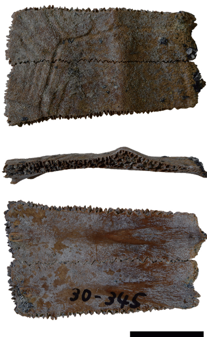
FIG. 2. Right second and third costals of Mauremys reevesii (HPMH-30A00392) from a late medieval (mid- to late 15th Century) pit-filling deposit at the Kusado Sengen-chō site. Scale bar represents 1 cm.

mutual sutural connections attributed to a single individual (HPMH-30A00392).