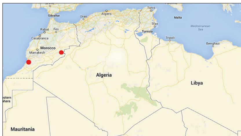
Fig. 17. Distribution of Cithaeron dippenaarae sp. n.