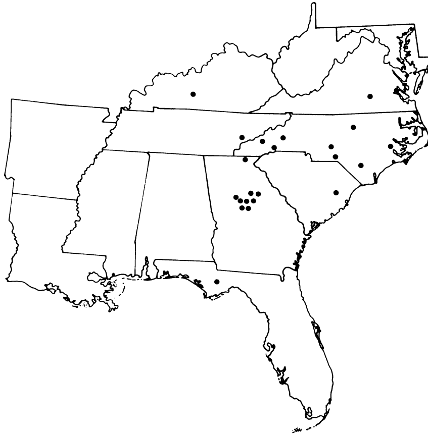
FIGURE 1. Map of southeastern United States showing origin of deer having hemorrhagic disease in 1971.

Acute HD constituted the classic syndrome 6 in which hemorrhages throughout the body characterized the disease. Petechial, ecchymotic, and frank hemorrhages frequently were encountered throughout the digestive tract. Erosions on the dental pad, hard palate, and tongue were not unusual in acute HD. Coronitis also occurred.