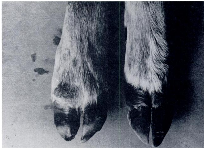
FIGURE 4. Sloughing hooves with secondary infection observed in deer recovering from hemorrhagic disease.